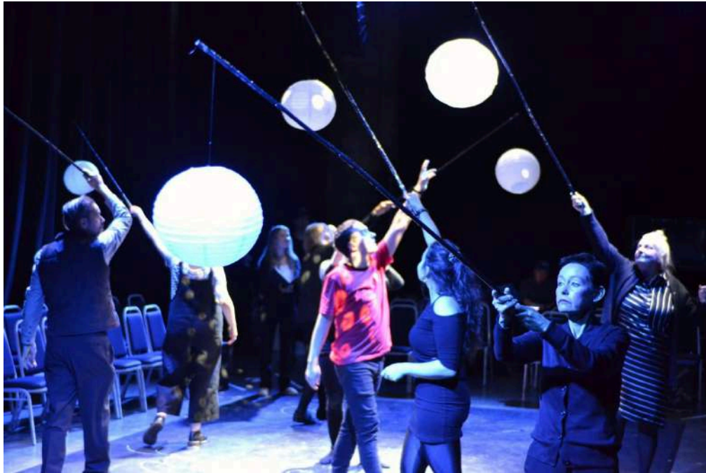
The Curious Incident of the Dog in the Night-Time