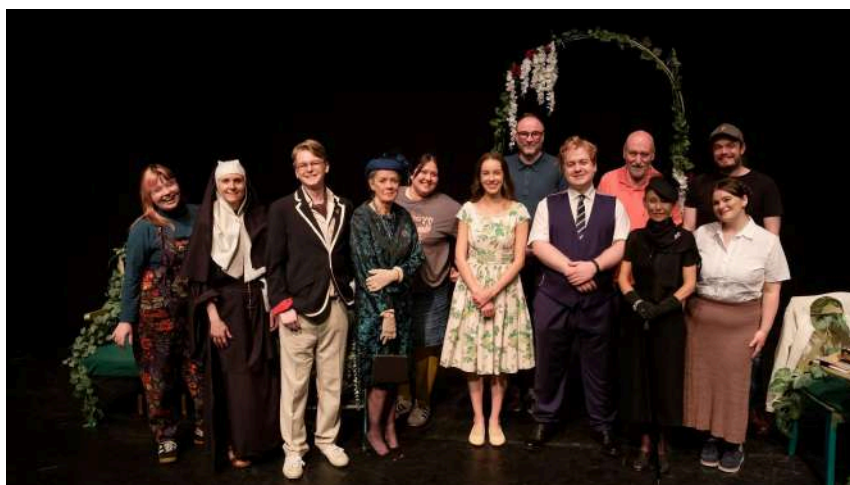
The cast and crew of Suddenly Last Summer.