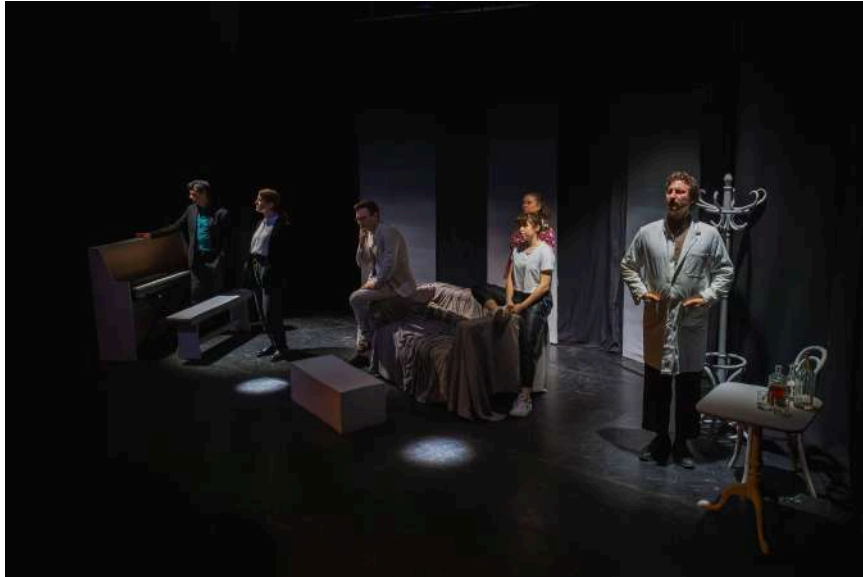
The cast of Incognito