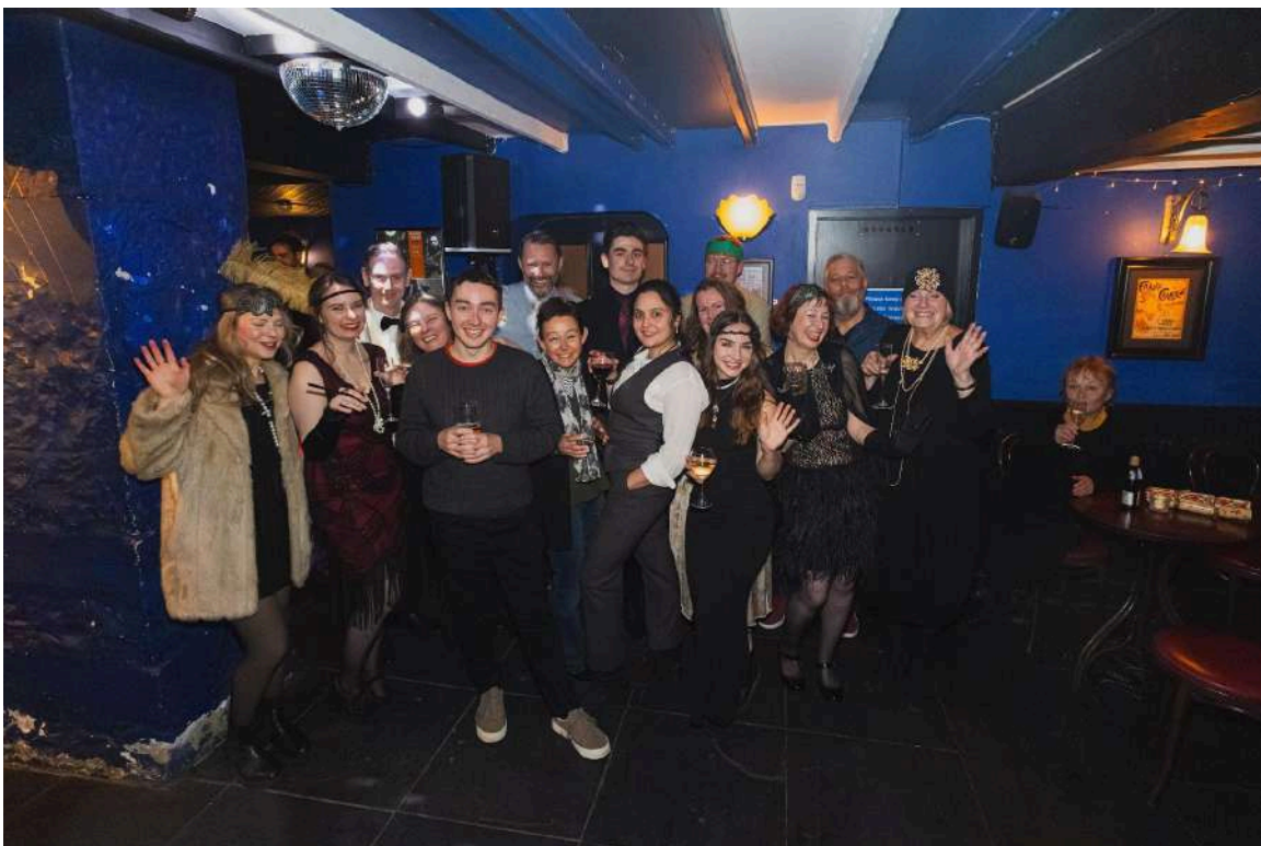
EGTG Members, December 2025