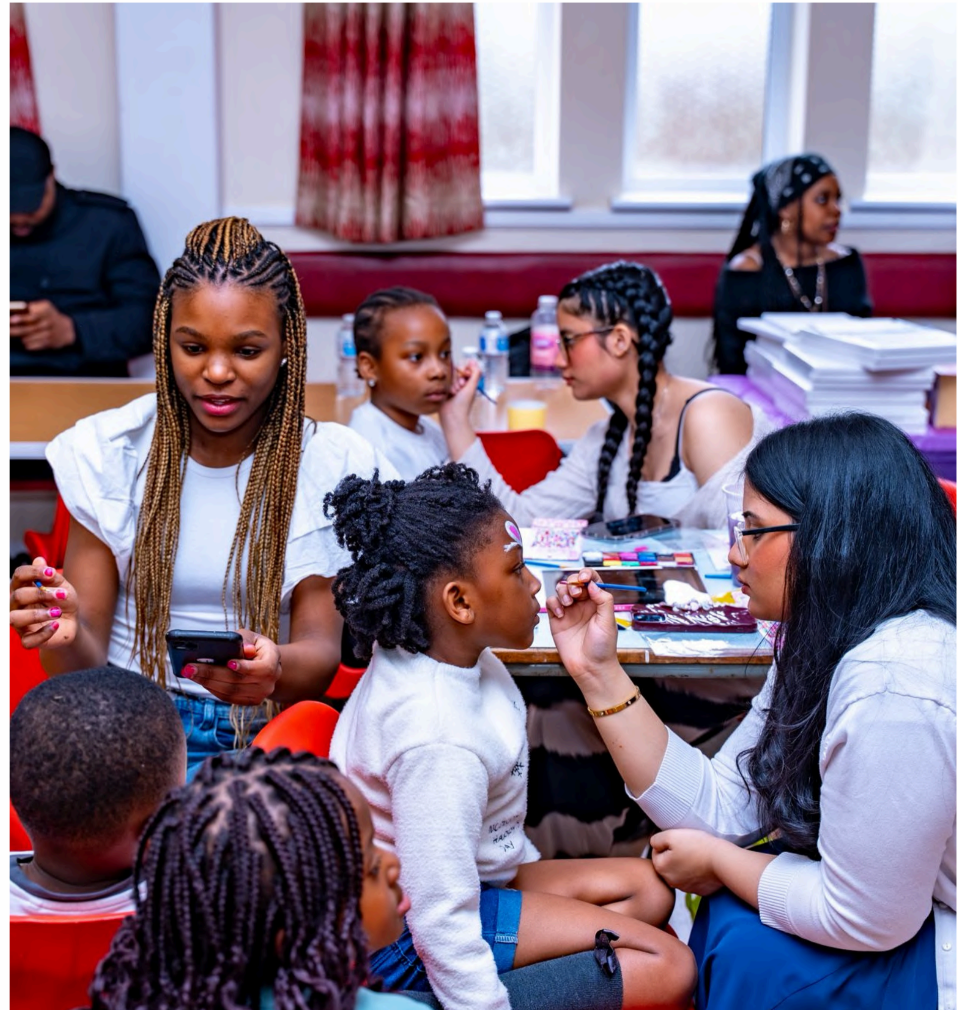
Family Community Event 2025