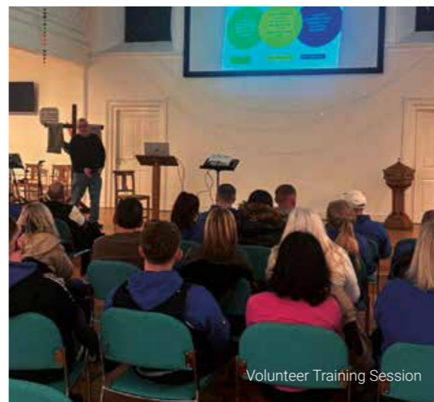
Volunteer Training Session

We will keep recognising and celebrating our volunteers through supported outings, peer connection, shared experiences, and genuine appreciation for the vital role they play in reaching people who might otherwise feel alone and unheard.