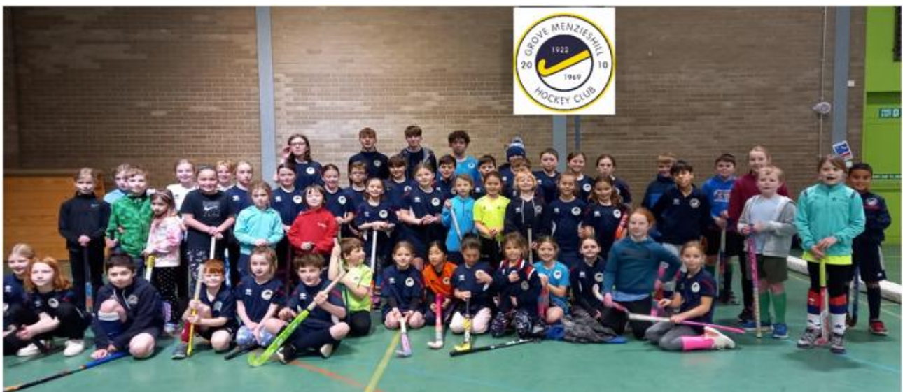
Youth Indoor Hockey Training session

The primary objective of the club is to increase participation in the sport of hockey within the Dundee area. Further progress has been made in achieving this objective. The club actively raises funds to support this.