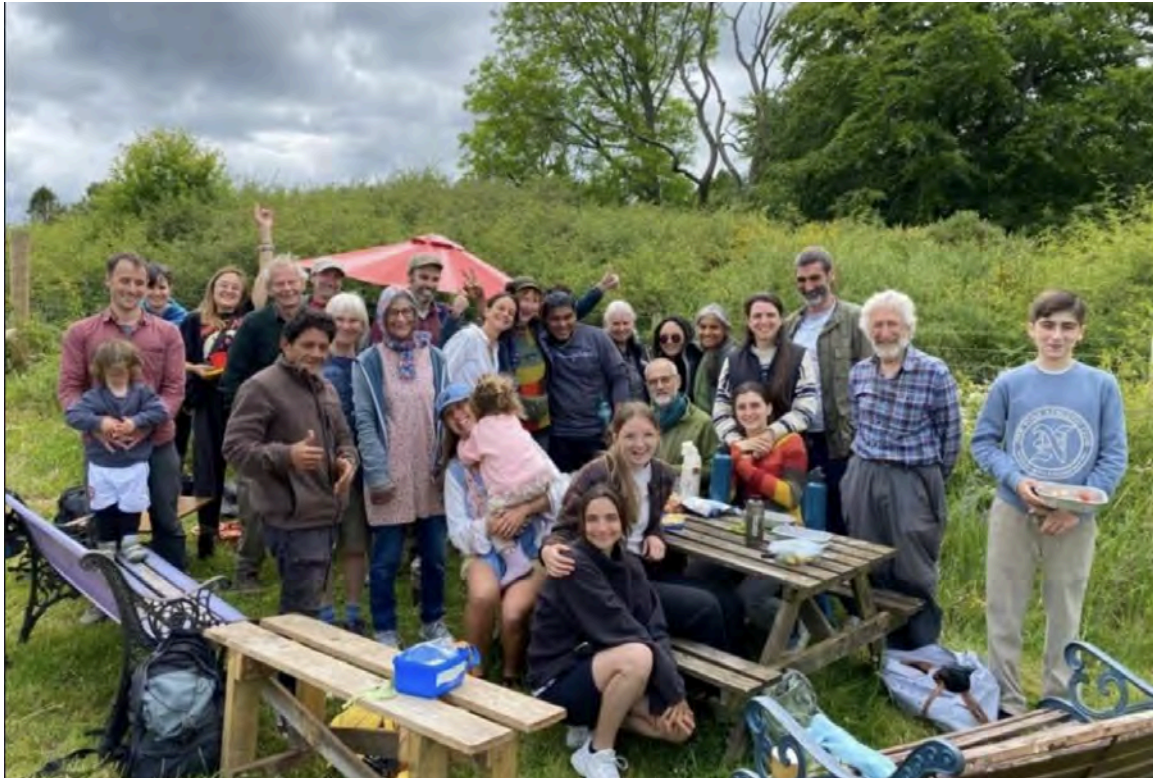
Image 14. Guatemalan visit in June