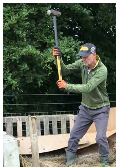
Image 6 and 7. Community Garden Composting and Maintenance