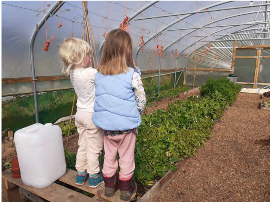
Image 9. Polytunnel Pixies