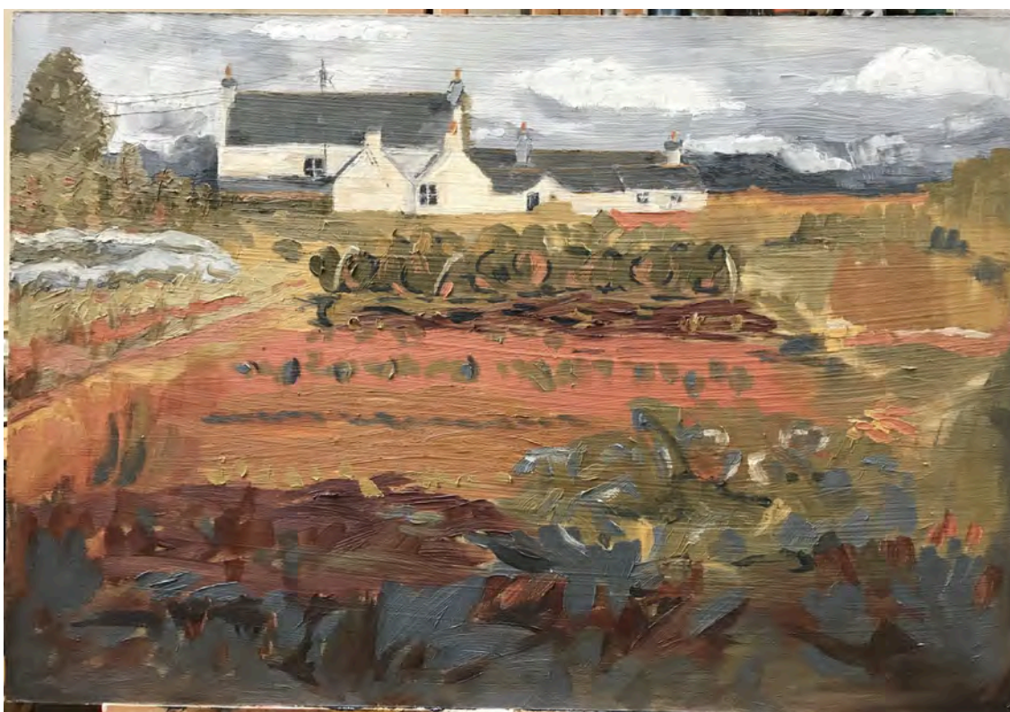
Image 15. Garden painting by pupil attending Kenneth Le Riche Summer School Workshop

Our unrestricted funds remain relatively healthy, thanks to a small number of regular donors, income from the pony grazing, some tree sales and a generous donation from a volunteer who planted a memorial tree. These funds are essential for our annual running costs, in particular insurance, accountancy, website, garden seeds, compost and tools, and tree safety works. Our policy on reserves is one of caution. Therefore, funds are held at year end to go towards such expenses, up to £500. Money in excess of this is subject to prioritisation by the Board in line with the charity's action plan.