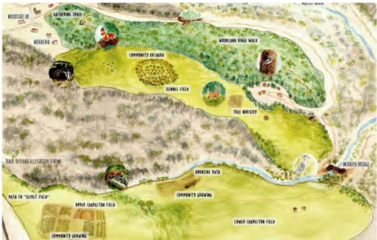
Figure 2. Map of the land of Forres Friends of Woods & Fields - Illustrated by Julie Adam