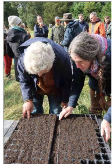
Images 12 and 13. Scything and Flora Workshops