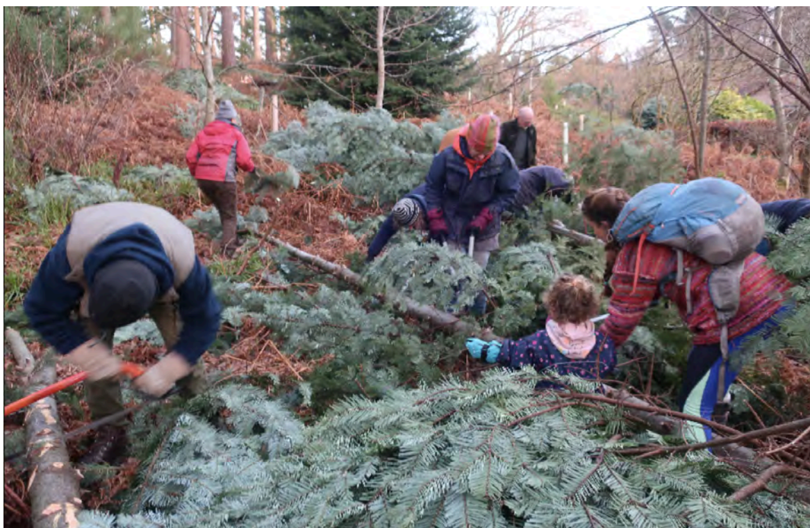
Image 1. Brashing the Fir

We continued our work in the Kennel Wood, with the aim to enhance its value as a wildlife rich oak woodland. This involved some minor felling of exotic conifers, further laurel control and planting a few more trees. Woodpeckers, owls, roe deer, badgers and squirrels all seem to be doing well, and our new interpretation board looks good.