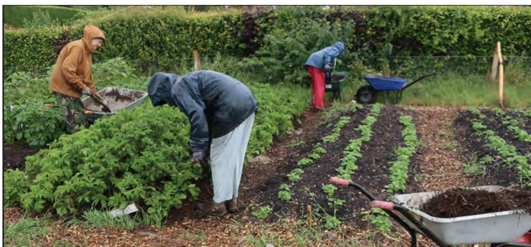
Image 5. Volunteers working in the garden

The year 2024/2025 saw the garden complete its fourth year of production and round off the first cycle of the four year rotation that began in 2022. That is to say that each of the four divisions of the field have now been occupied in turn by each of the vegetable families- potatoes and jerusalem artichokes, brassicas, roots and alliums. This gives us the chance to review our future cultivations and rotations as well as increasing productivity with well planned successional and intercropping activity so that our no-dig beds are never bare.