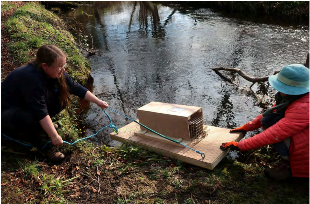
Image 4. Setting up Mink Trap

Invasive species monitoring and control continues, mainly Himalayan balsam, few-flowered leek and the occasional giant hogweed; we've been surveying for the latter around the floodscheme land on the Mosset upstream. In collaboration with the Rivers Trust, we've now got a mink raft and mink trap on the river, the raft having a clay pad to detect footprints, the trap humane, sending a wifi signal if triggered; so far we caught one pine marten, released unharmed although very cross.