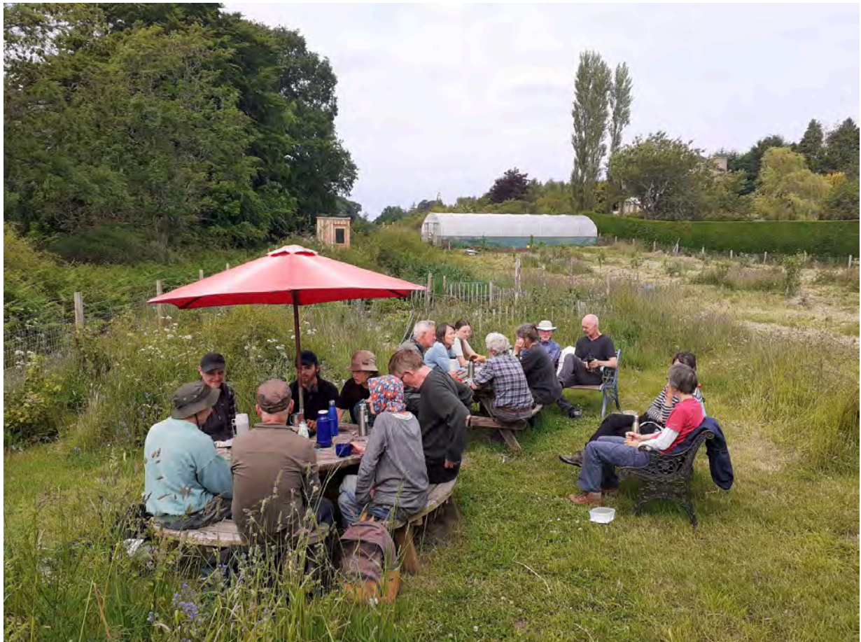
Image 8. Community Garden Tea Break

The potting shed/community hub, tool shed and compost toilet, which were acquired during the previous year, have now become an integral part of the structure of the garden and definitely proved their worth.