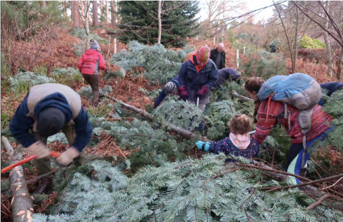
Image 1. Brushing the Fir

We continued our work in the Kennel Wood, with the aim to enhance its value as a wildlife rich oak woodland. This involved some minor felling of exotic conifers, further laurel control and planting a few more trees. Woodpeckers, owls, roe deer, badgers and squirrels all seem to be doing well, and our new interpretation board looks good.