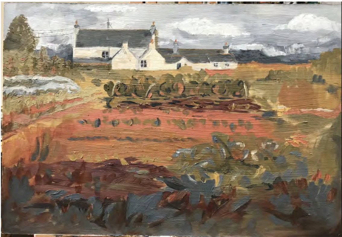
Image 15. Garden painting by pupil attending Kenneth Le Riche Summer School Workshop

Our unrestricted funds remain relatively healthy, thanks to a small number of regular donors, income from the pony grazing, some tree sales and a generous donation from a volunteer who planted a memorial tree. These funds are essential for our annual running costs, in particular insurance, accountancy, website, garden seeds, compost and tools, and tree safety works. Our policy on reserves is one of caution. Therefore, funds are held at year end to go towards such expenses, up to £500. Money in excess of this is subject to prioritisation by the Board in line with the charity's action plan.