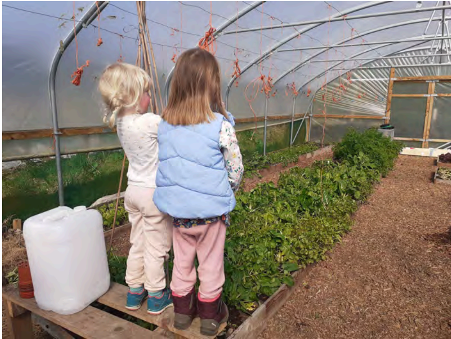
Image 9. Polytunnel Pixies