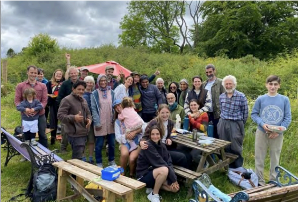
Image 14. Guatemalan visit in June