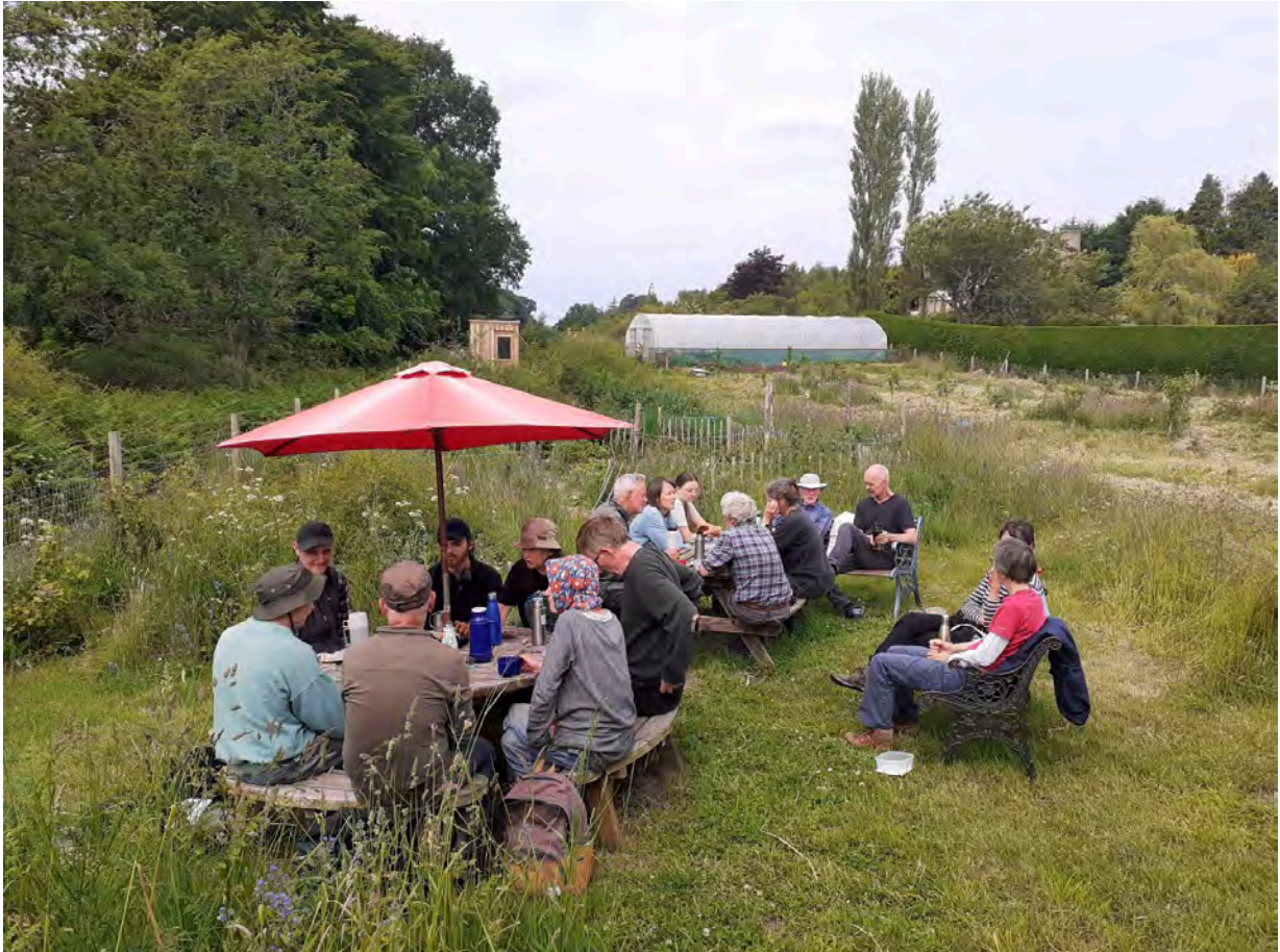
Image 8. Community Garden Tea Break

The potting shed/community hub, tool shed and compost toilet, which were acquired during the previous year, have now become an integral part of the structure of the garden and definitely proved their worth.