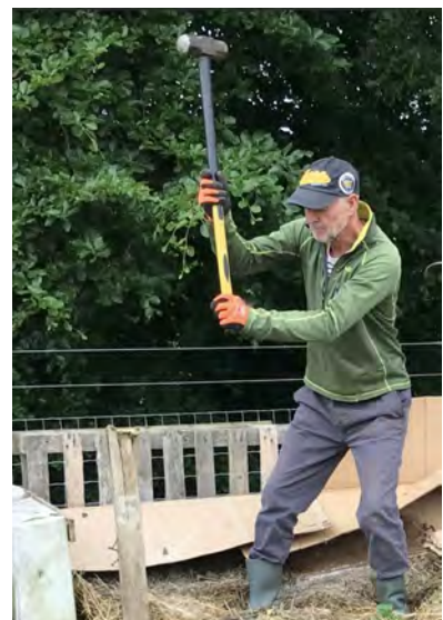
Image 6 and 7. Community Garden Composting and Maintenance