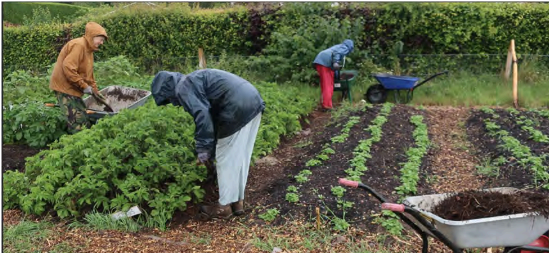
Image 5. Volunteers working in the garden

The year 2024/2025 saw the garden complete its fourth year of production and round off the first cycle of the four year rotation that began in 2022. That is to say that each of the four divisions of the field have now been occupied in turn by each of the vegetable families- potatoes and jerusalem artichokes, brassicas, roots and alliums. This gives us the chance to review our future cultivations and rotations as well as increasing productivity with well planned successional and intercropping activity so that our no-dig beds are never bare.