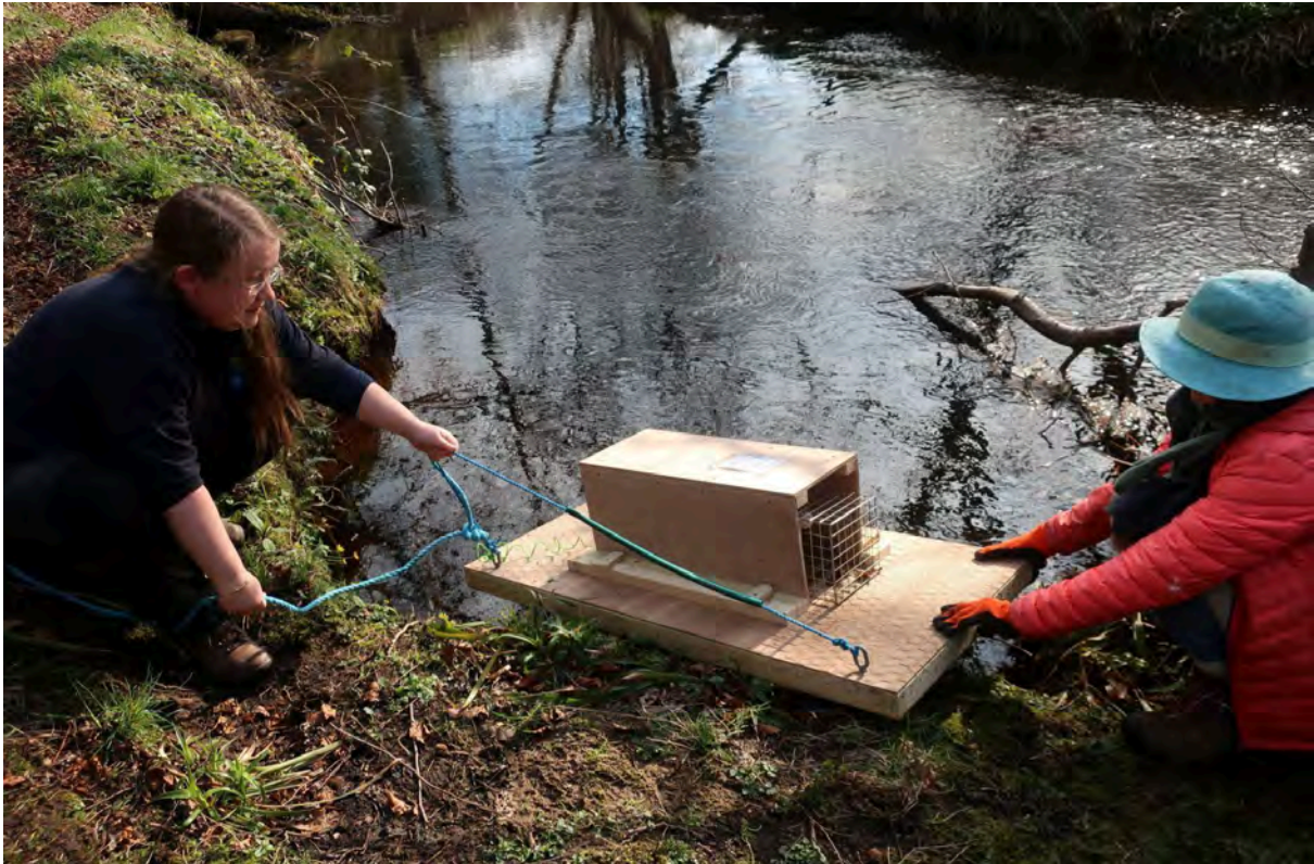
Image 4. Setting up Mink Trap

Invasive species monitoring and control continues, mainly Himalayan balsam, few-flowered leek and the occasional giant hogweed; we've been surveying for the latter around the floodscheme land on the Mosset upstream. In collaboration with the Rivers Trust, we've now got a mink raft and mink trap on the river, the raft having a clay pad to detect footprints, the trap humane, sending a wifi signal if triggered; so far we caught one pine marten, released unharmed although very cross.