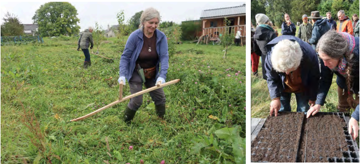
Images 12 and 13. Scything and Flora Workshops