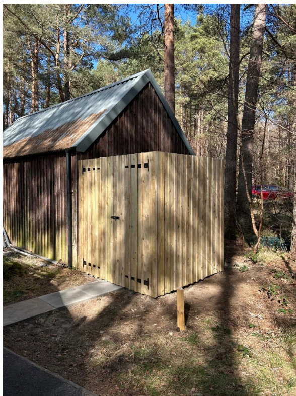
Pictures showing the area adjacent to the Banchory Alexander Park Club shed pre and post installation of portaloo facility, April 2025