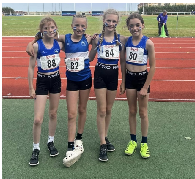
Under 11 girls RAM League winners

A bit warmer indoors at the Emirates Arena Glasgow we sent a girls Under 12 team to compete in the national SUPERteams event. This is for the youngest athletes in the Club to gain experience in an event very much geared to be fun. We have traditionally been successful in this competition, with 2025 no exception, the girls coming in a silver medal position against teams from Clubs all over Scotland. That all bode well for the outdoor season. The Club competed in the local RAM League, as well as many athletes entering National and District Championships both indoor and outdoor, with huge success. Indeed in the RAM League, the Club reached the final in 5 of the age groups, with the U11 Girls winning their age group against stiff competition.