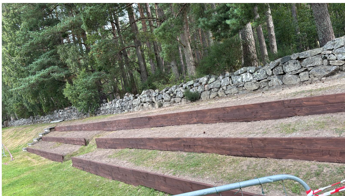
Picture showing the improved seating area adjacent to the Alexander Park track (August 2025). The previous seating area had become unsafe due to rotting wood. This area is used extensively on training nights and at Club events.