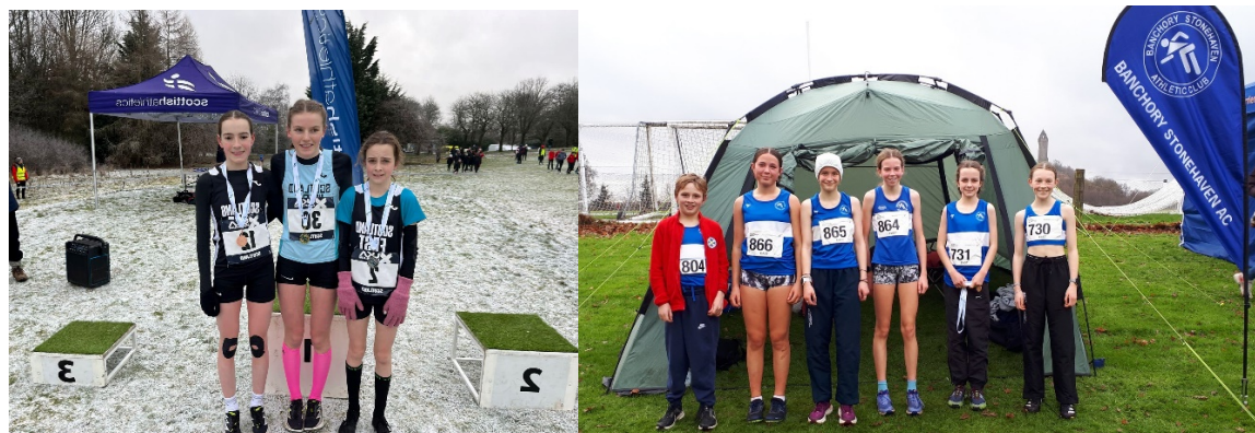
BSAC as part of Scotland East in U13G, U13B and U15G