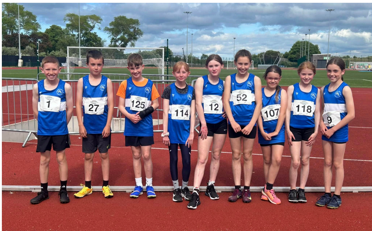
U12 athletes at the outdoor national SUPERteams at Meadowbank, Edinburgh