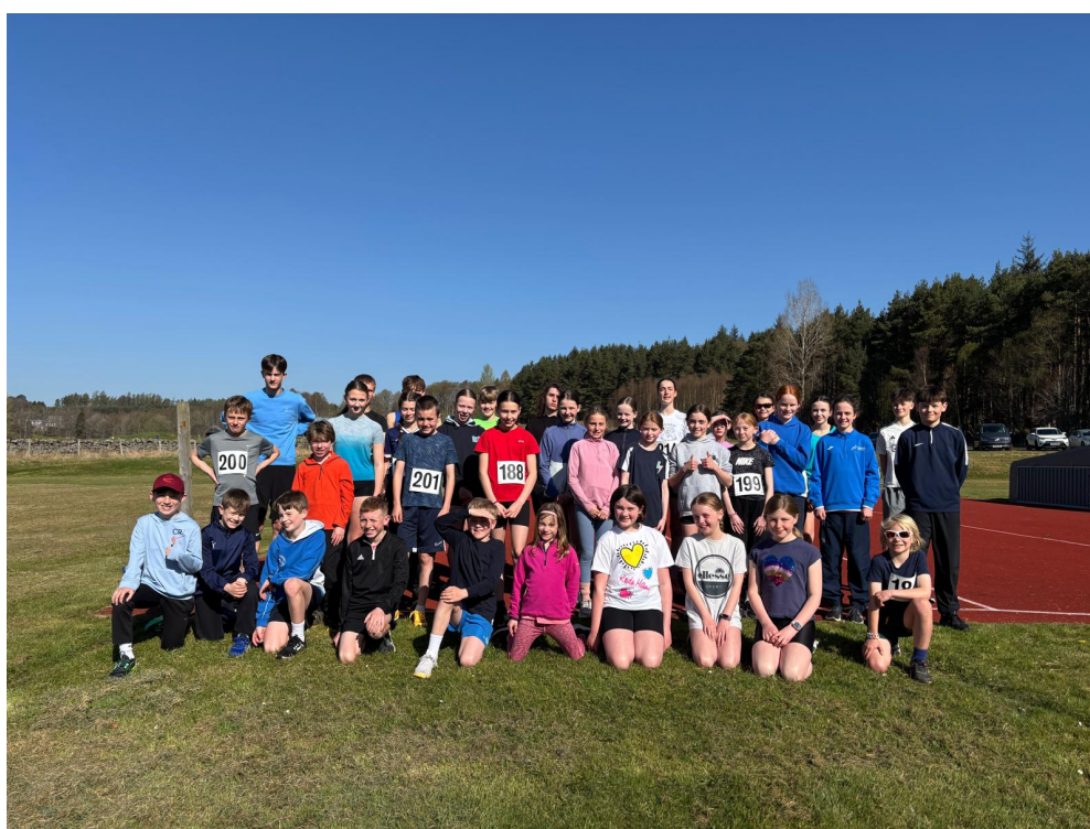
Athletes competing at the first Club event of 2025, BSAC Quadrathlon, April 2025