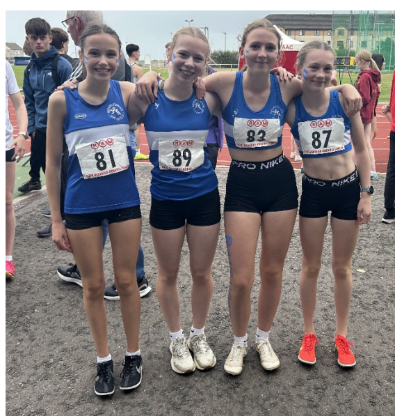
BSAC RAM League Teams in Perth and Aberdeen