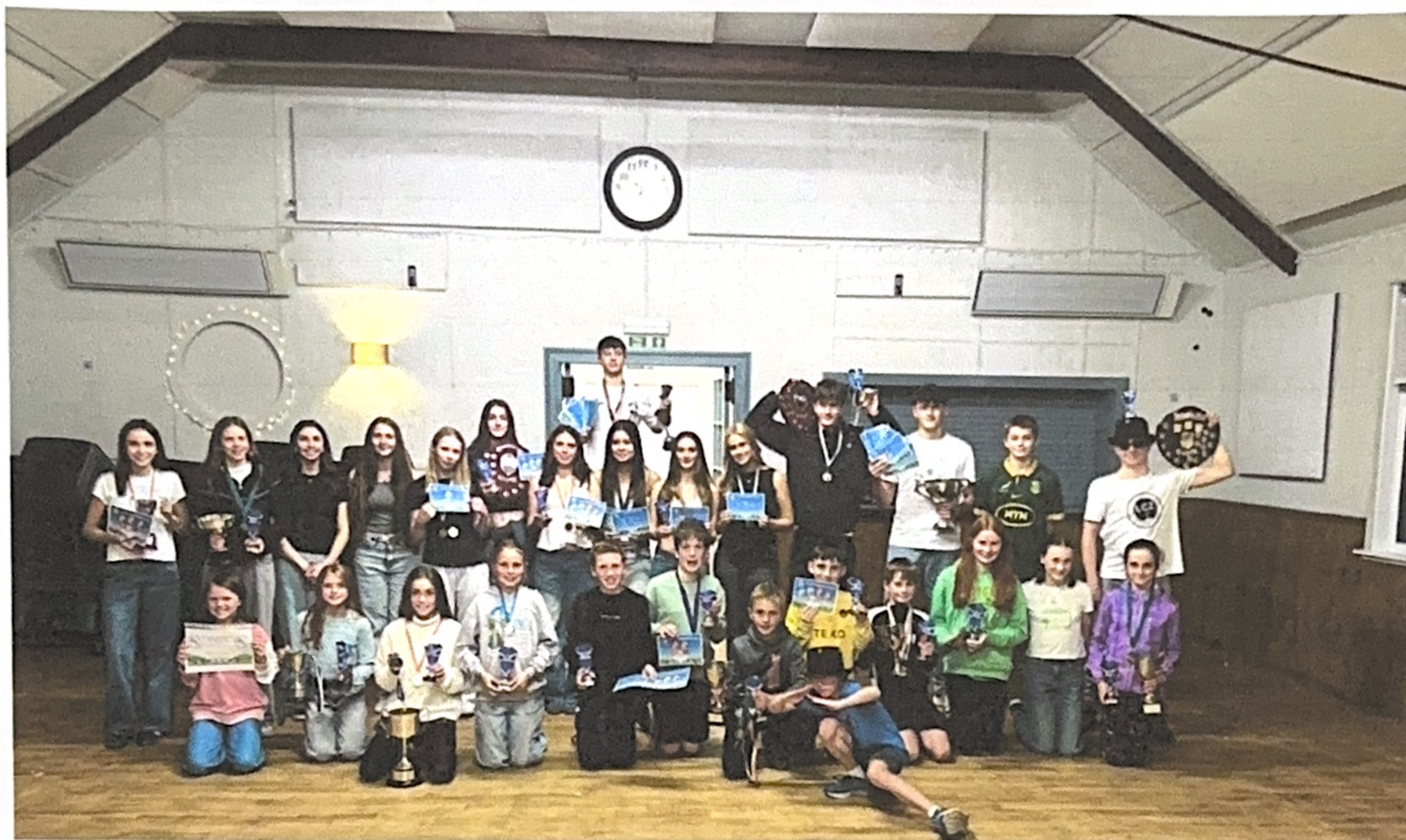
Celebrating success 2025 at our Annual Awards night, October 2025

Signed on behalf of the charity Trustees