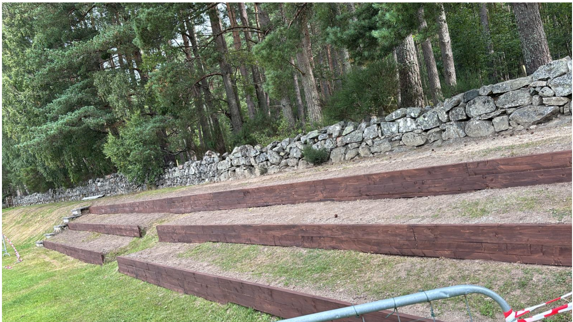
Picture showing the improved seating area adjacent to the Alexander Park track (August 2025). The previous seating area had become unsafe due to rotting wood. This area is used extensively on training nights and at Club events.