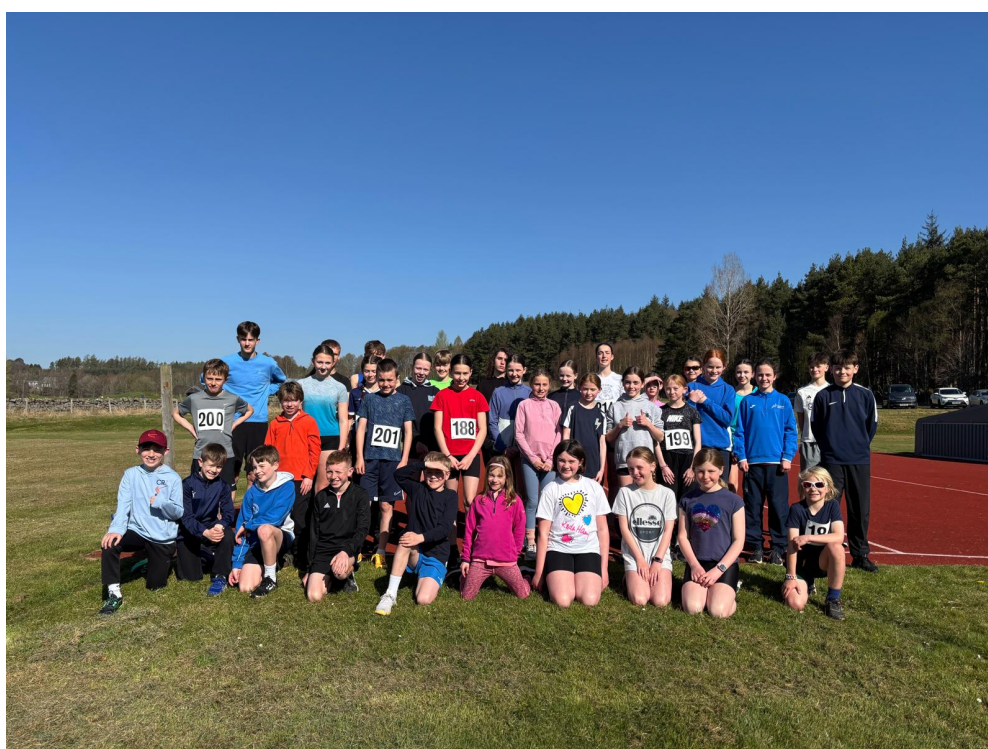
Athletes competing at the first Club event of 2025, BSAC Quadrathlon, April 2025