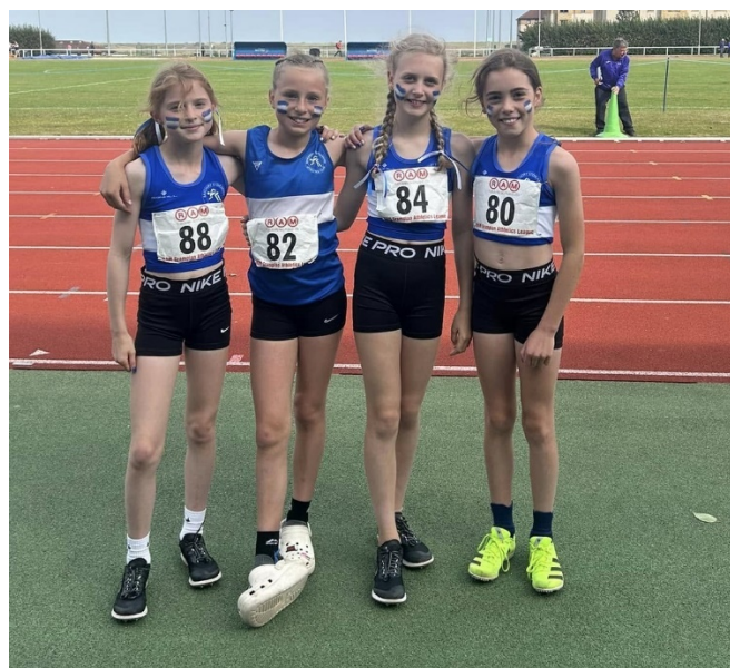
Under 11 girls RAM League winners

A bit warmer indoors at the Emirates Arena Glasgow we sent a girls Under 12 team to compete in the national SUPERteams event. This is for the youngest athletes in the Club to gain experience in an event very much geared to be fun. We have traditionally been successful in this competition, with 2025 no exception, the girls coming in a silver medal position against teams from Clubs all over Scotland. That all bode well for the outdoor season. The Club competed in the local RAM League, as well as many athletes entering National and District Championships both indoor and outdoor, with huge success. Indeed in the RAM League, the Club reached the final in 5 of the age groups, with the U11 Girls winning their age group against stiff competition.