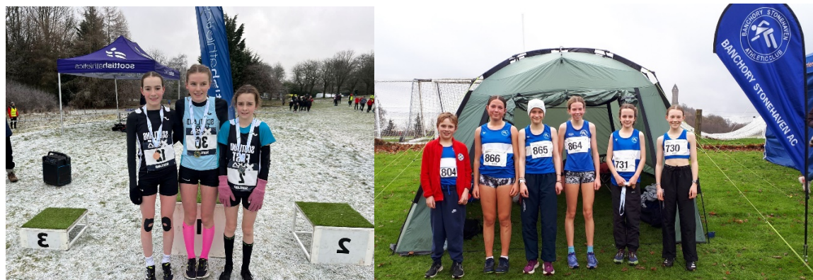
BSAC as part of Scotland East in U13G, U13B and U15G