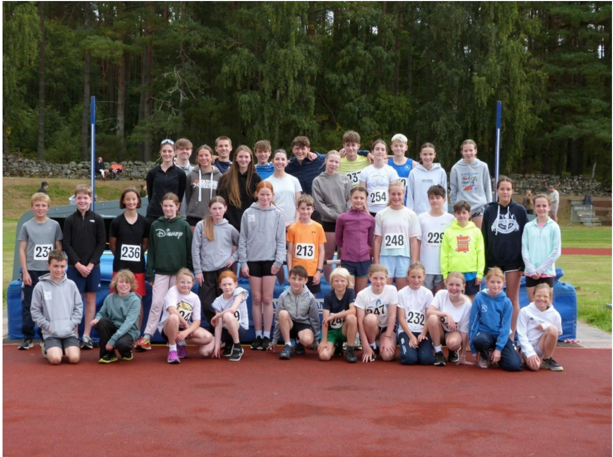
Athletes getting ready to compete at the 2025 Club Champs