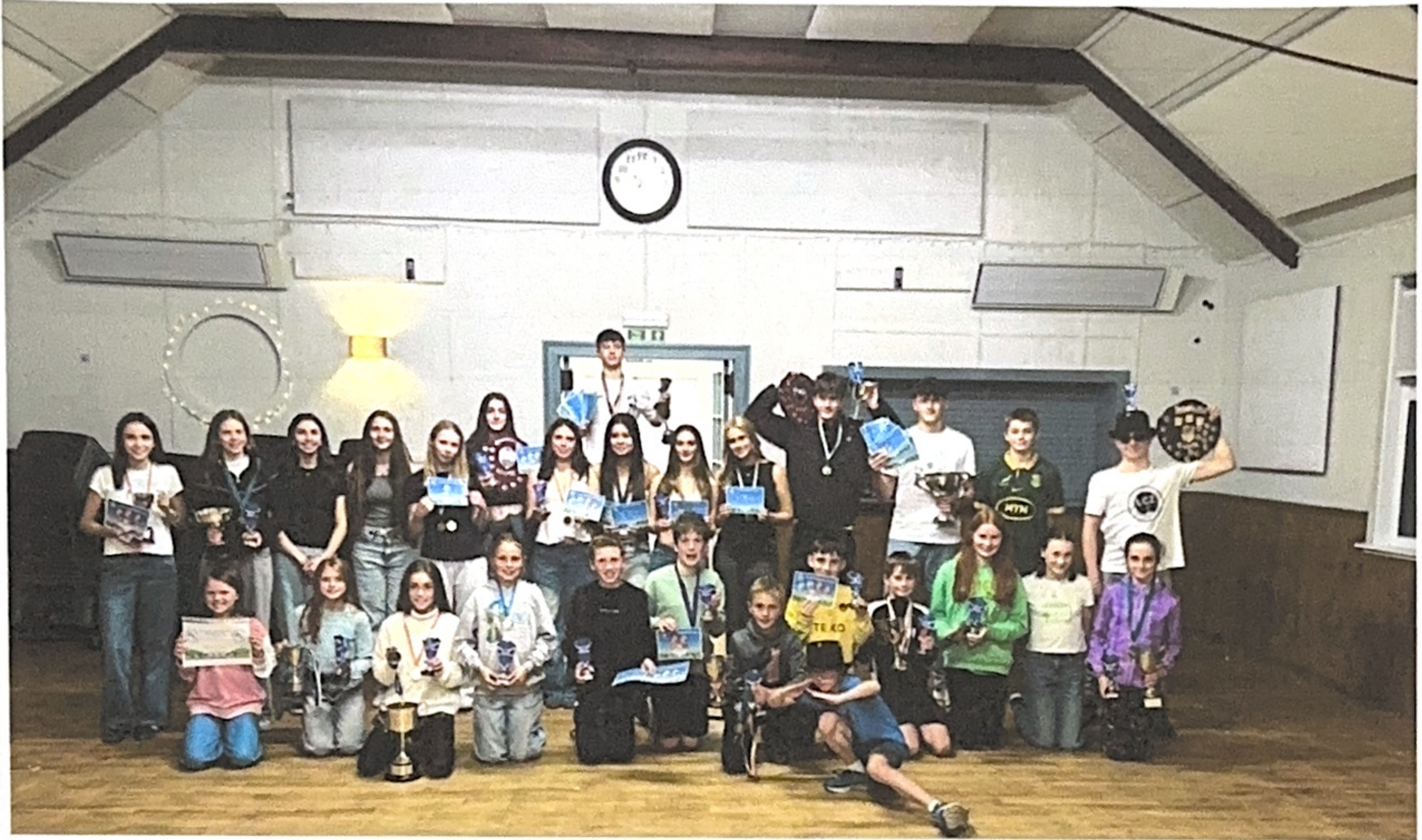
Celebrating success 2025 at our Annual Awards night, October 2025