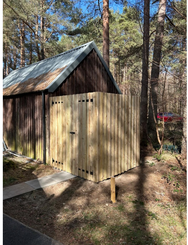
Pictures showing the area adjacent to the Banchory Alexander Park Club shed pre and post installation of portalo facility, April 2025