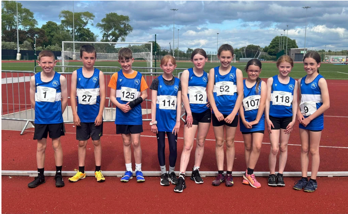
U12 athletes at the outdoor national SUPERteams at Meadowbank, Edinburgh