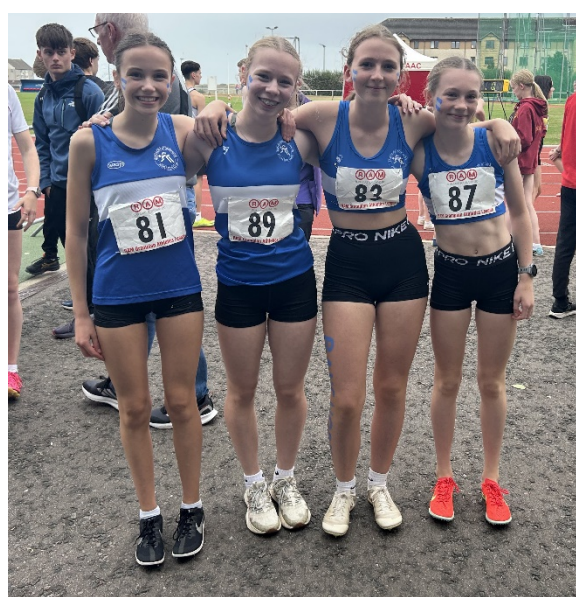
BSAC RAM League Teams in Perth and Aberdeen