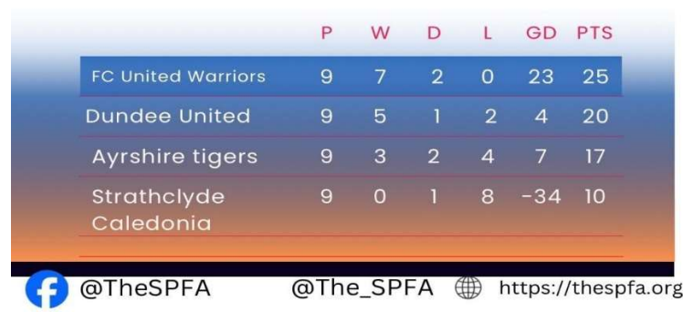
Figure 1: Final League table from SPFA season 2024 – 2025