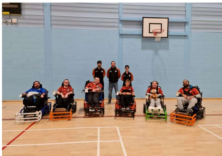
Figure 2: Tigers and coaches at match day 3 in January 2026

The Tigers next competed in the first round of Scottish championship matches in October. We started off our league campaign brilliantly, winning both our games 1-0. Match day two took place on the 30 th of November with the Tigers having mixed results, having lost their first game 3-1 but winning their second game 4-0. The tigers played great as a team and showed their fighting spirit. Going into match day three in January 2026 the Tigers are lying in second place in the league.