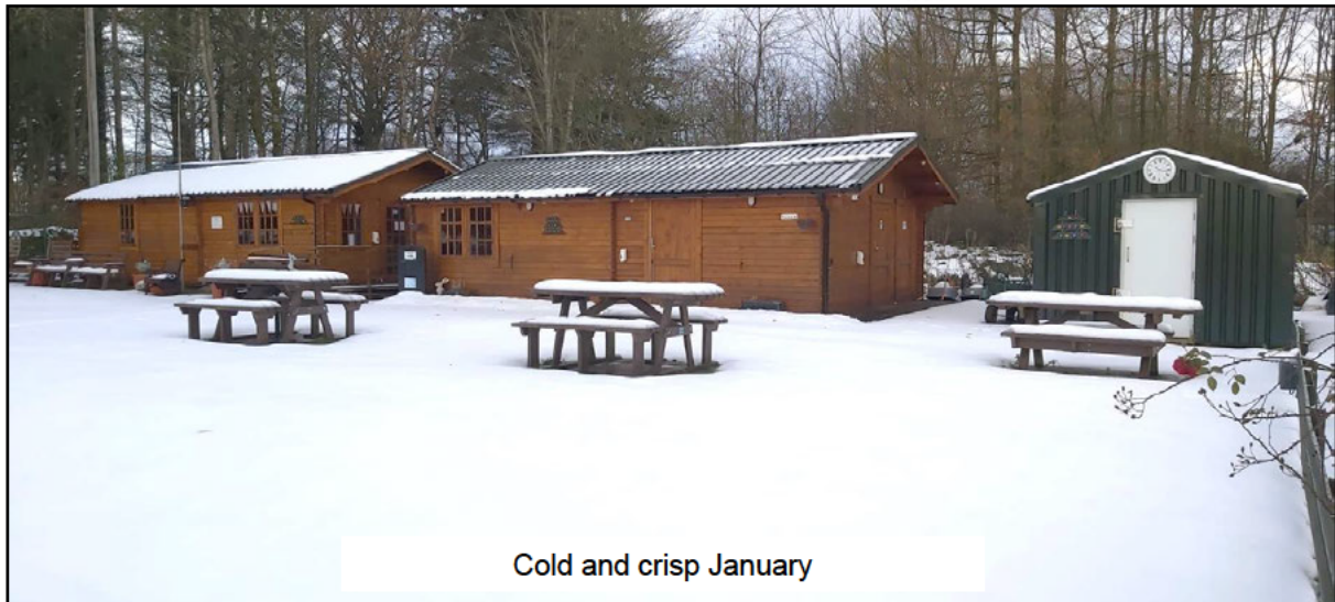
Cold and crisp January

Winter flooding still occurred at the far end of the site. This was mainly due to external drains and ditches being inundated by heavy rains and melting snow. Unfortunately, there is not a lot that we are able to do until the floods soak away naturally.