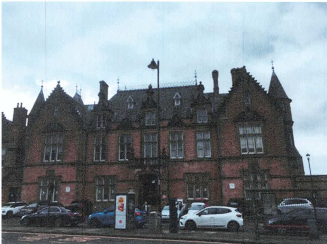
Stirling Sheriff Court