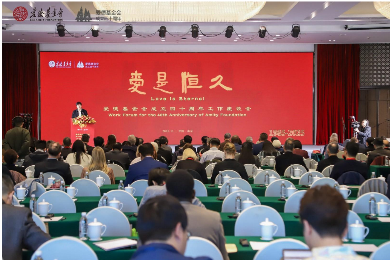
Conference in Nanjing in November 2025 to celebrate 40 years of the Amity Foundation

This was a year of encouraging achievements in China, despite the changing, and challenging, circumstances there for our partners. Achievements included the launch of a new Palliative Care skills qualification; participation in an international symposium on autism; and, with sponsorship from the SCCG, the graduation of an Amity staff member with a Masters in Inclusion and Special Educational Needs; and support for our long-standing partner, the Amity Foundation, now a large NGO, as it celebrated 40 years since it was founded by Chinese Christians. We are always inspired by the commitment and hard work by partners in the areas of education and health care, and pleased about our continuing ability to support them.