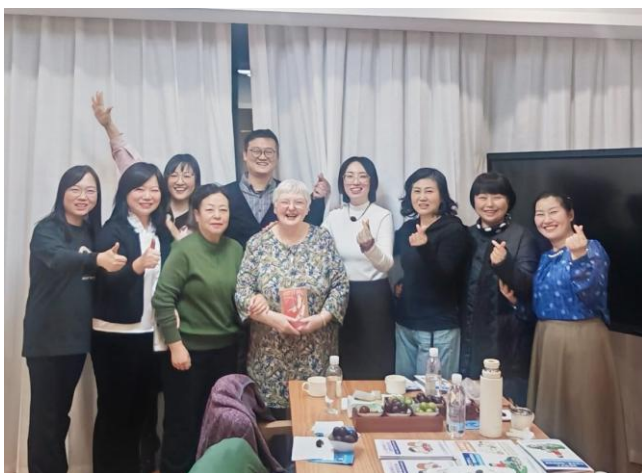
Meeting with Shengjing Hospital volunteers in Shenyang

As always, hospitality is key for our Chinese partners, who looked after Tricia very well.