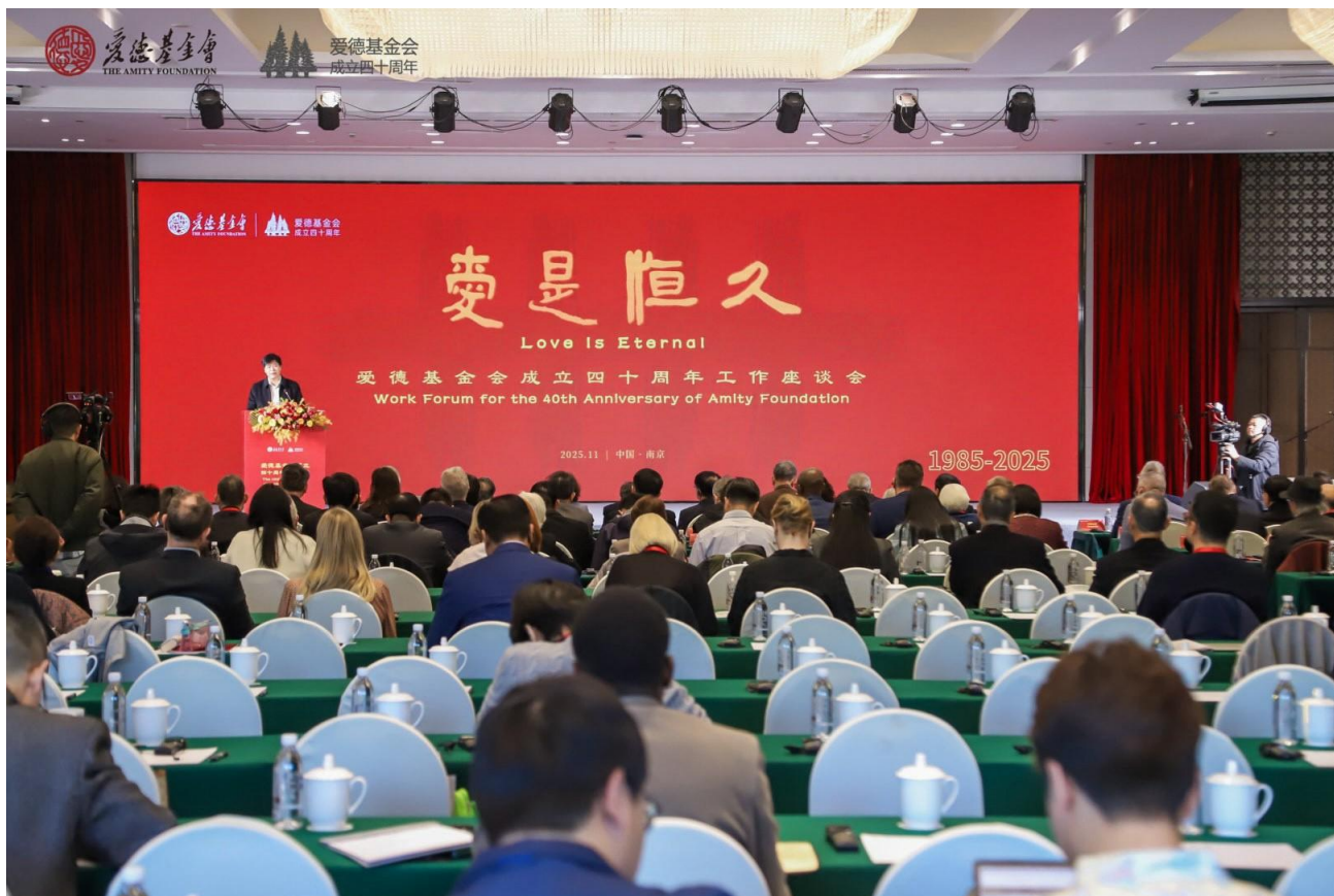
Conference in Nanjing in November 2025 to celebrate 40 years of the Amity Foundation

This was a year of encouraging achievements in China, despite the changing, and challenging, circumstances there for our partners. Achievements included the launch of a new Palliative Care skills qualification; participation in an international symposium on autism; and, with sponsorship from the SCCG, the graduation of an Amity staff member with a Masters in Inclusion and Special Educational Needs; and support for our long-standing partner, the Amity Foundation, now a large NGO, as it celebrated 40 years since it was founded by Chinese Christians. We are always inspired by the commitment and hard work by partners in the areas of education and health care, and pleased about our continuing ability to support them.