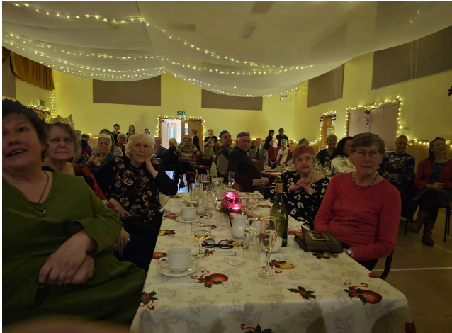
Applecross Senior Christmas dinner 2024, Adult Mental Health Grant funded