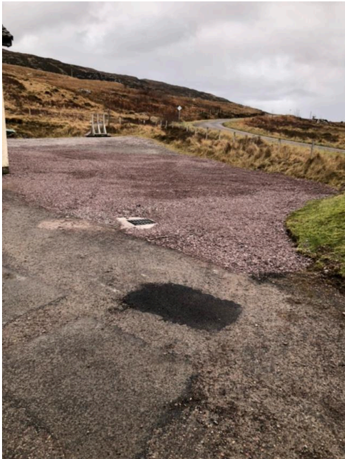
NHI funded repairs to Hall carpark