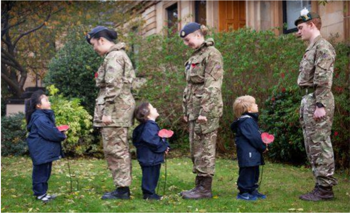
Nursery and Cadets