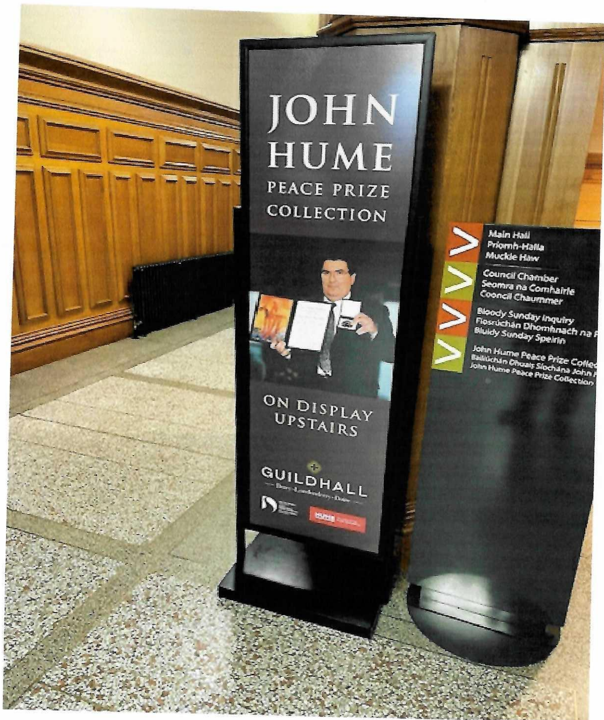
Display board at the entrance of the Guildhall, Derry.