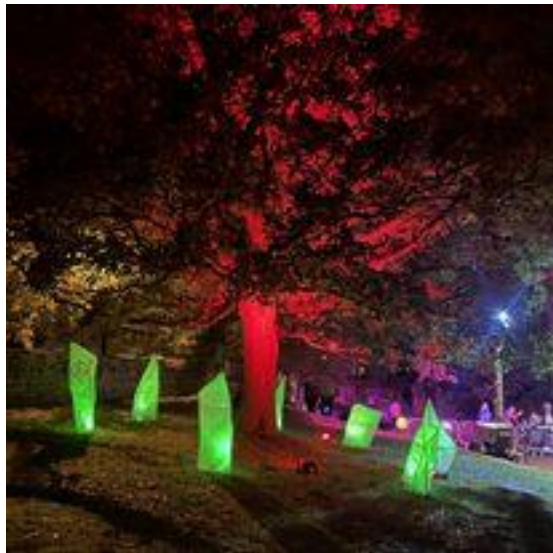
Solas Cholmcille Light Sculpture Trail