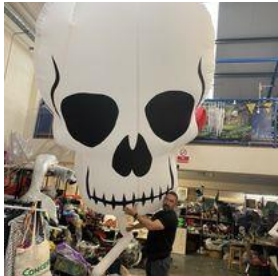
Carnival Parade Base Production Masterclass