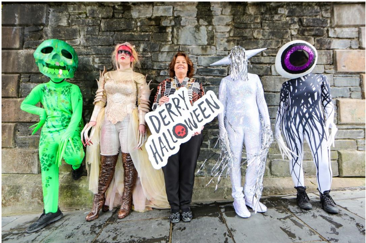
Press Launch with the Mayor