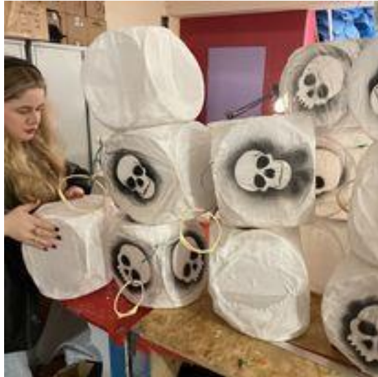
Lantern Making Workshops