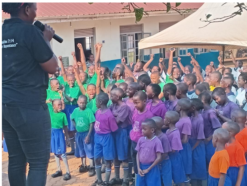
Waiting to go to class in St Dominic's PS

school reports from Uganda for circulation to the sponsors. It was also agreed that a 10% increase would be made to the fees requested of sponsors for both Day and Boarding pupils and that this increase would be communicated to our sponsors as soon as possible.