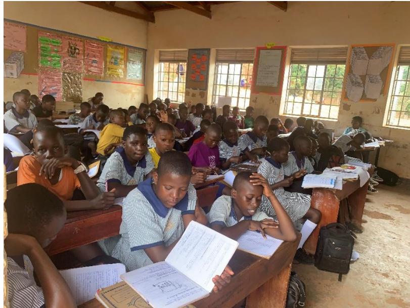
Hard at work in a crowded classroom

Another excellent development in 2024 was the continued sponsorship of four children into post primary school. Two of these children are sponsored by St Colmcille's HS in Crossgar and it is hoped that a partnership between St Colmcille's and St Charles Lwanga Secondary School in Kibiri will continue to develop over the coming years.