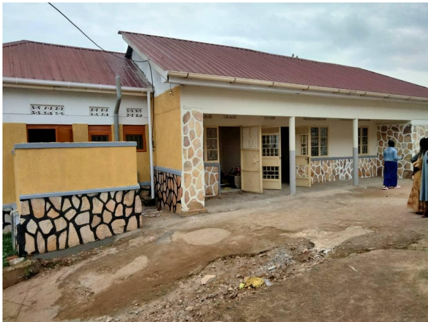
The completed community clinic at Kibiri

News from Kibiri indicated that work to the clinic was nearing completion. In April the group made a final payment to help with the completion of the community clinic in Kibiri. Support for the work to provide the clinic had been provided by the group for many years and members were pleased that the work had been completed and an official opening for the building was being planned by partners in Uganda. The clinic will be named in honour of the Parish of Kilmore and Killyleagh. Plans to provide an information update for the parishioners of Kilmore and Killyleagh Parish were discussed.