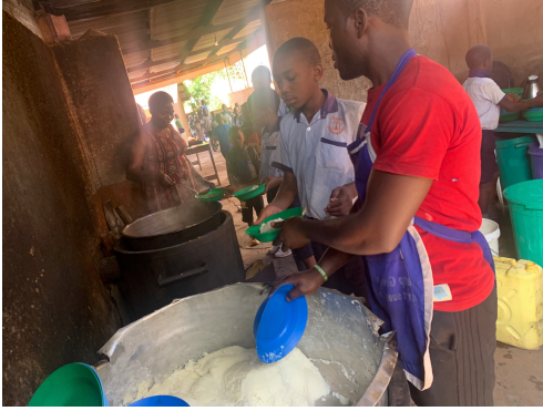
Preparing Lunch - maize & beans