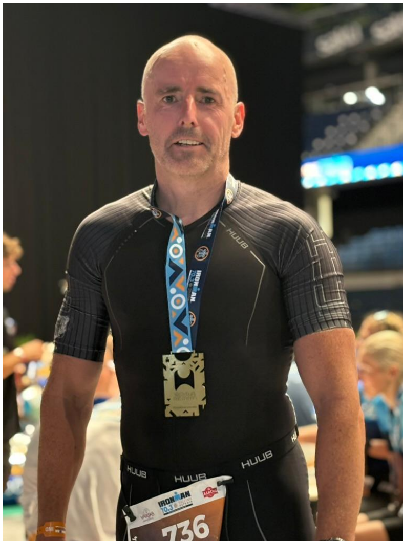
Jumble Sale, Beragh

Thanks to everyone who sponsored him to raise an incredible £5,550!