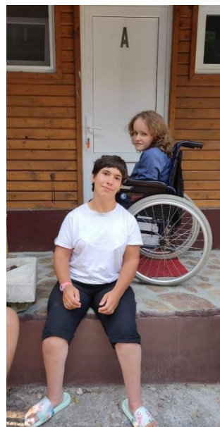
Pictured: Casa St Patrick, very happy on holidays. If it wasn't for the minibus these trips probably wouldn't be possible. Thanks again School Aid Romania for providing the much used bus.