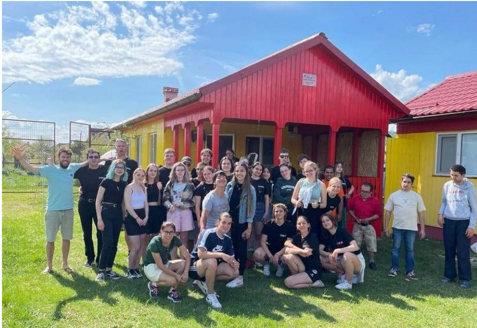
Pictured above: Hands on Brasov, Belgium with our young adults in Harman.

They had great fun with the young people from Hands on Brasov from Belgium when they visited before the summer and the Beragh group in the summer. They are really looking forward to the School Aid Romania groups returning next year.