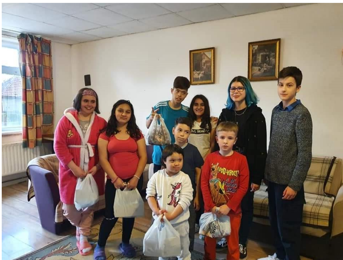
Pictured above: Casa St Maria receive Easter treats from School Aid Romania