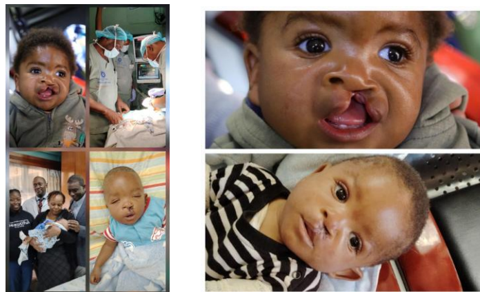
Cleft palate surgery – before and after