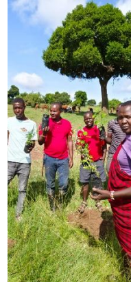
Community Tree planting in Transmara Distric