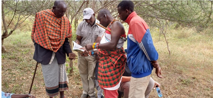
The Herbalist and members of the Botanical Garden support Group, Laikipia.

Work on creating a botanical garden to preserve endangered species in Laikipia continues, and we agreed to provide funding to fence an area against elephant predation and grazing animals