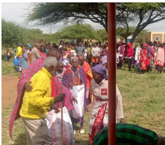
Community elders gather to receive emergency food supplies