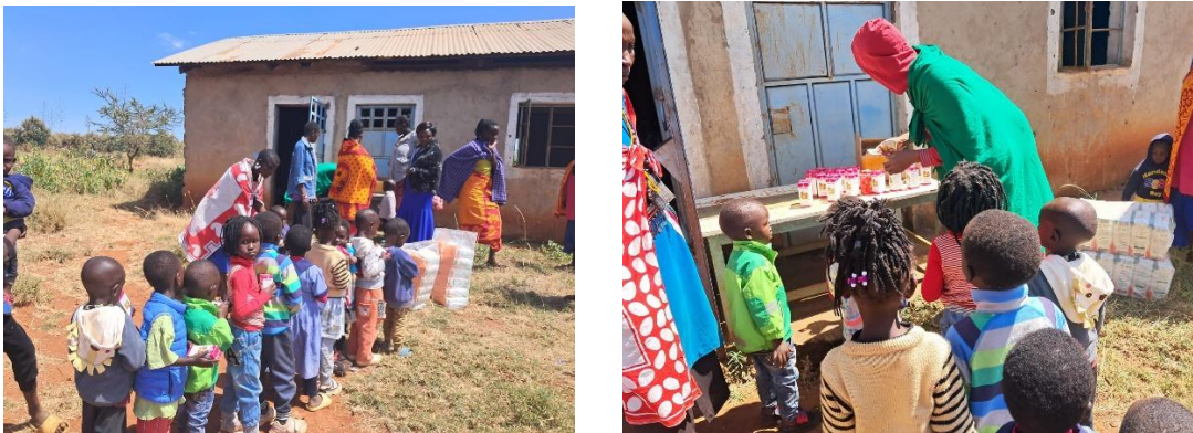
Children receiving nutritious food support

Community Feeding Programmes. It was agreed that one remote Maasai community near Ngong, Kajiado County, with whom we have had a longstanding relationship, should continue to receive support for the provision of food and water (brought from Nairobi) for both the elderly and young children, and a worming programme for school children. This community is severely disadvantaged by drought and the support provided has been gratefully received. Although need is very real, this is not sustainable for GIFT International in the long term, and we are urging the community to identify ways of becoming more self-reliant. While measures to become more sustainable may be beyond the financial capacity of GIFT International, engaging the community in discussions about long-term sustainability may help to prepare them to seek alternative funding sources.