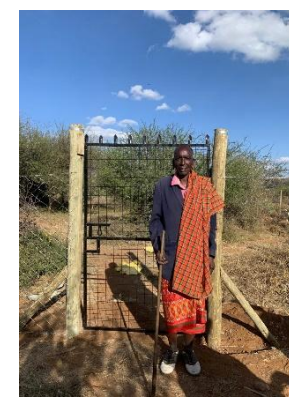
Undertaking installation of elephant deterrent fence around Botanical Garden