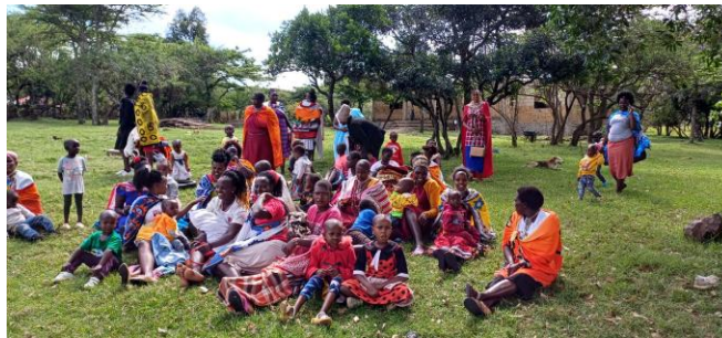
Group discussions on the future of the Mother and Baby Project

In keeping with our policy aim to encourage self-sufficiency within 5 years of commencing projects, where applicable, we held a meeting to explore how we can enable the mother and baby project to become self-financing. This challenge had been laid down to the community last year, allowing them time to consult across the community and to give it due consideration. All ideas and proposals were discussed and assessed. It is a challenging question, how to make something that has no conclusion, self-sustaining – babies will always be born and there will always be associated costs. In establishing this project, we wanted to demonstrate a safer alternative for mothers-to-be, and attendance at the maternity facility has proved favourable to the community. There was no question that the community wishes the maternal health project to continue and, while all would have been happy if we simply continued to fund the project, there was a reasonable degree of understanding that it now needs to move to a different level.