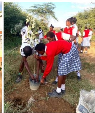
Tree planting in Laikipia involving schools and the county official