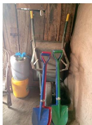
Tools for tree planting in Gede