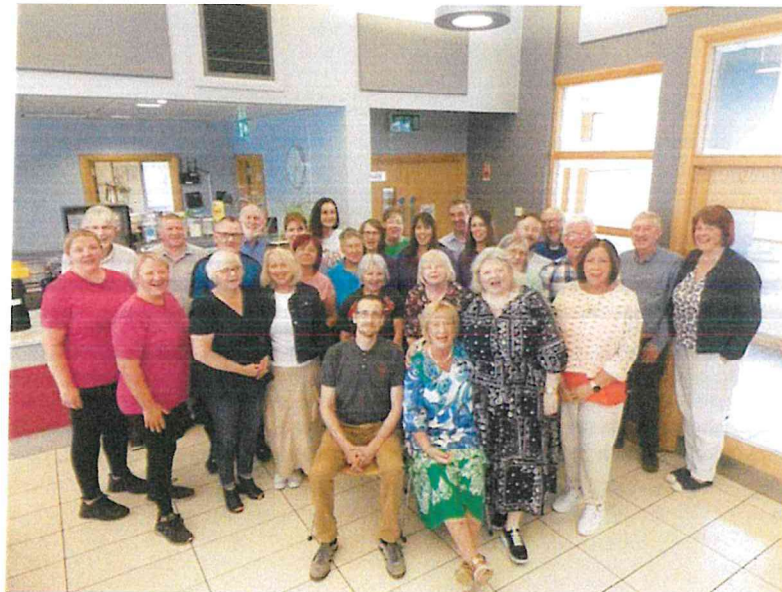
Some of the SPCA Trustees, Staff and Volunteers

A clean and fit for purpose facility is crucial to engaging the Community around us and meeting need long term. The Board have invested over £20,000 in the year and are still seeking funding for capital works including LED lights and a new minibus. We also continue to invest in our staff and volunteers with a range of mandatory and professional development opportunities. Staff have completed training in areas such as Diploma in Community Development, Risk Assessment, Child Protection and much more.