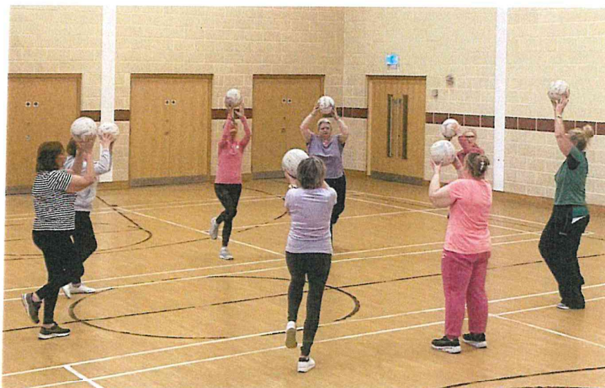
Walking Netball Taster Sessions For Ladies