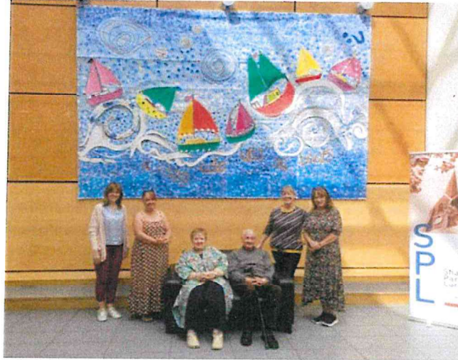
SPCA Good Relations Project "Rising Tide" on display in the Jethro Centre foyer

A clean and fit for purpose facility is crucial to engaging the Community around us and meeting need long term. The Board have invested over £20,000 in the year and are still seeking funding for capital works including LED lights and a new minibus. We also continue to invest in our staff and volunteers with a range of mandatory and professional development opportunities. Staff have completed training in areas such as Diploma in Community Development, Risk Assessment, Child Protection and much more.