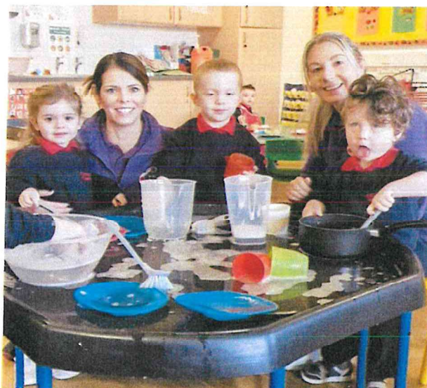
Staff and children at Kidz Patch Playgroup

Delivered in partnership with Kings Park Primary School, Kidz Patch is a core part of our services, delivering quality care for an average of 35 children per day (primary school age) and 24 children per day (Playgroup). We are delighted to note the improved financial performance this year. This was due to investment by the Committee into a new vehicle (to facilitate pickup from new schools) and additional numbers coming from Kings Park.