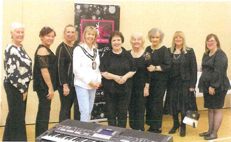
Mayor of ABC Council with Lurgan Musical Society at the SPCA 30th Anniversary Event

We also delivered a range of new craft and wellbeing sessions during the year including candle making, glass painting, ceramics, walking netball and much more to diversify our portfolio of activities.