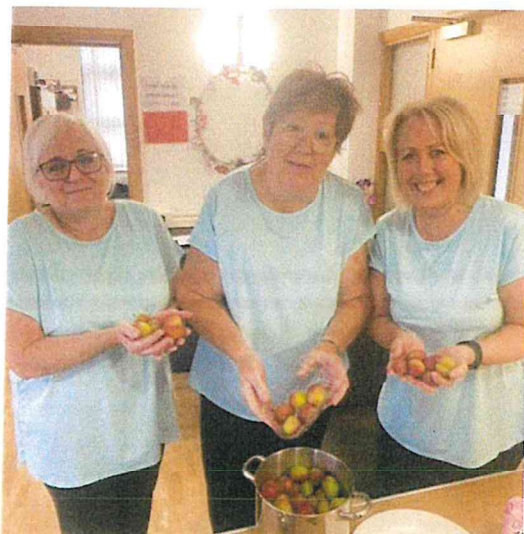
Staff at Palms Day Centre

Delivered in partnership with Kings Park Primary School, Kidz Patch is a core part of our services, delivering quality care for an average of 35 children per day (primary school age) and 24 children per day (Playgroup). We are delighted to note the improved financial performance this year. This was due to investment by the Committee into a new vehicle (to facilitate pickup from new schools) and additional numbers coming from Kings Park.