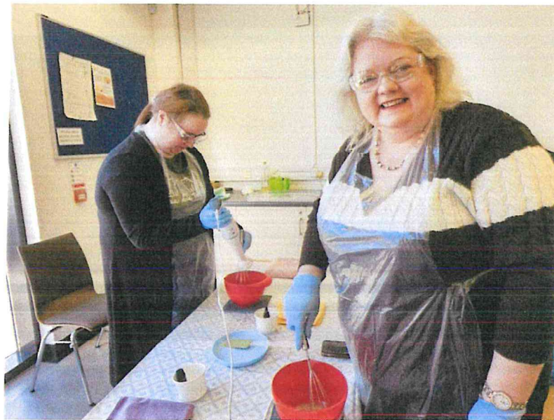
New Craft Classes in the 23/24 year

We also delivered a range of new craft and wellbeing sessions during the year including candle making, glass painting, ceramics, walking netball and much more to diversify our portfolio of activities.