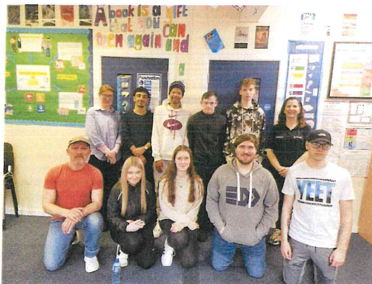
Young People taking part in the "Think Twice" knife crime project

Carole also delivered a range of knife crime workshops across the Council area to engage at risk youth.