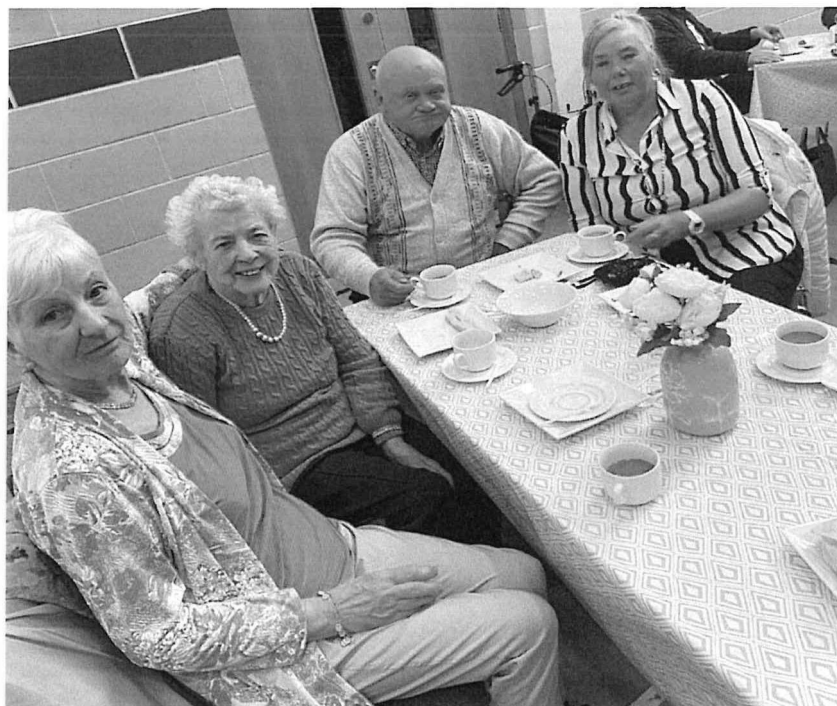
Attendees at our first "post-covid" Tea Dance for Care Home residents and local older people