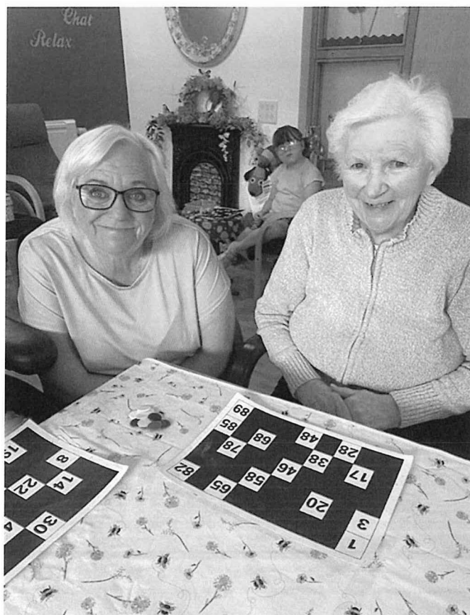
Staff and Client at Palms Day Centre

Delivered under our service level agreement with The Southern Health and Social Care Trust (and supplemented each year by our own fundraising efforts), PALMs have supported up to 14 clients per day each Wednesday, Thursday and Friday for 48 weeks of the year. These clients are at high risk of social isolation as they have a range of physical and/or mental impairments. Each day during the year clients were transported to the Centre and welcomed by the staff/volunteer team. Clients were engaged in conversation and a tailored plan of physical/mental stimulation. They were also provided with morning tea and a nutritious healthy lunch.