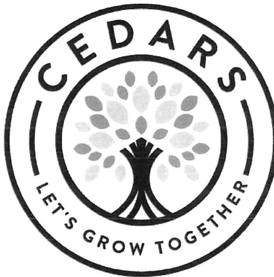
New logo for the Cedars project