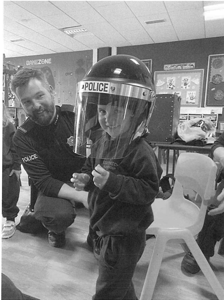
PSNI visit to Kidz Patch Playgroup

for the financial year ended 31 March 2023