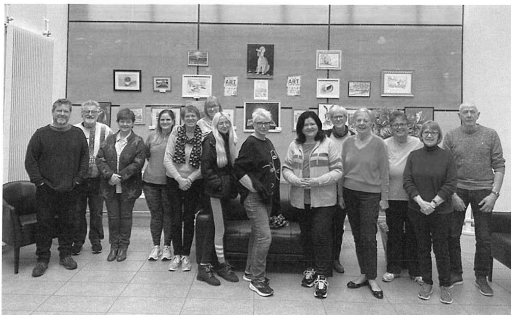
Members of the Paul King Art Club displaying their creations in the Jethro Centre foyer

for the financial year ended 31 March 2023