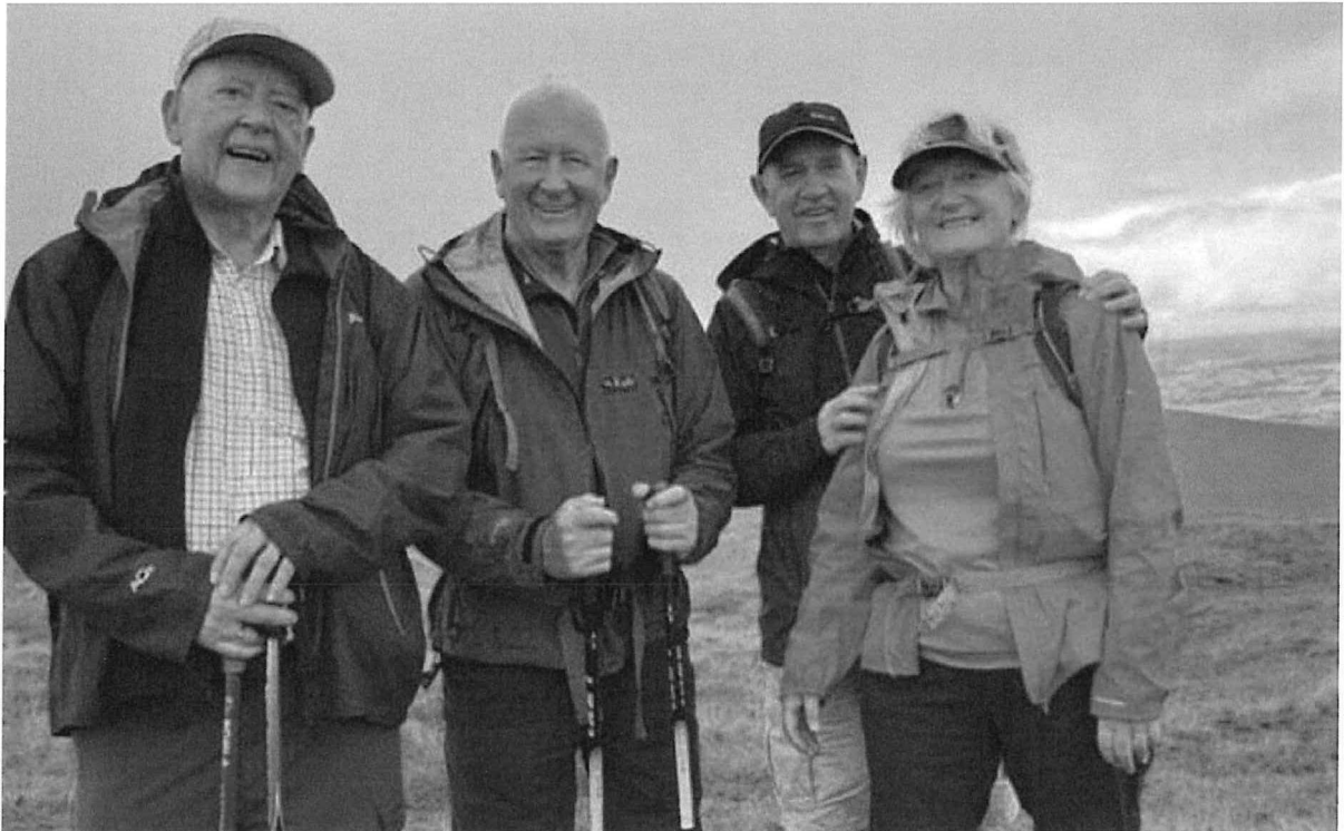
Members of the Cedars Walking Group out on the hills of Northern Ireland

for the financial year ended 31 March 2023