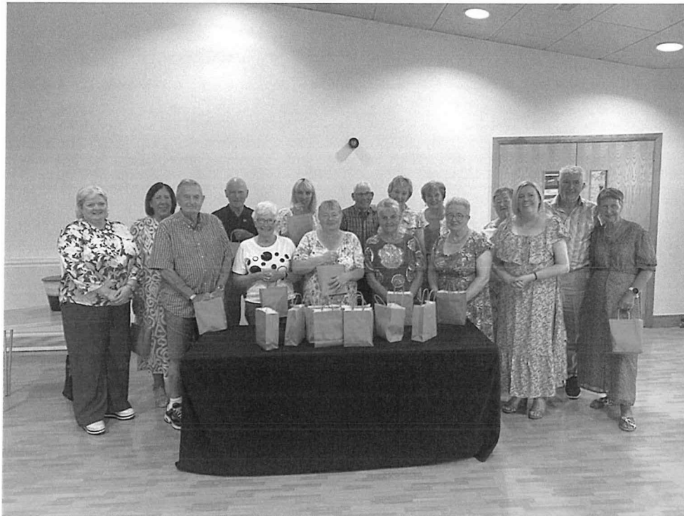
Just some of the SPCA volunteer team at the Volunteer Celebration evening 2023

The surge in energy costs since the war in Ukraine has also resulted in energy bills which are unsustainable long term. The Board are currently investigating a range of energy saving solutions. They have consulted with Action Renewables to prepare an options appraisal. The Board are also seeking quotes for a full replacement of on-site lighting to LED and funding opportunities to pay for same. There have also been increasing costs to maintaining our mini-bus and the Board are aware that a replacement will likely be required in the next 12 months.