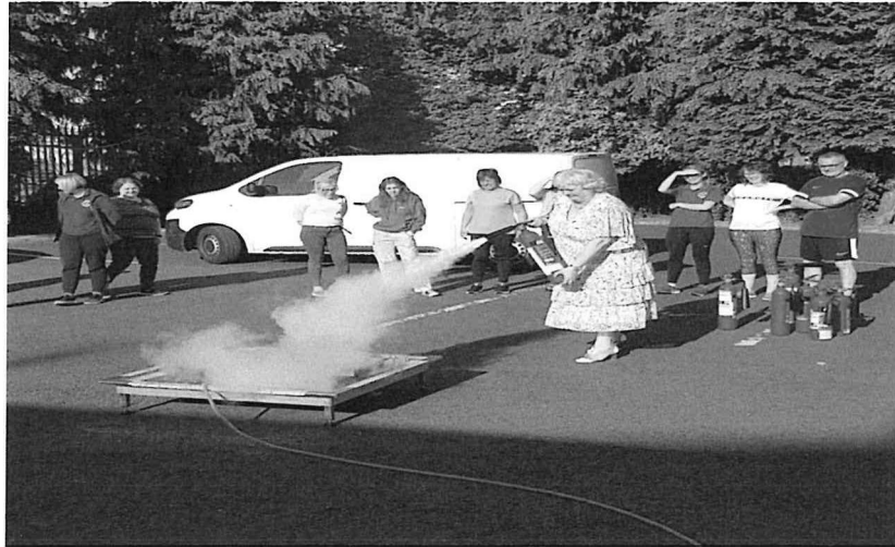
Staff and Volunteers completing their fire management training 2023.

for the financial year ended 31 March 2023