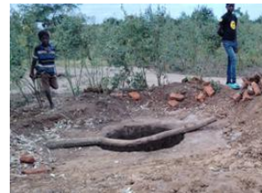
Water secured at one of the wells

2. Distribution of 60 goats to 60 households through a pass-on program to promote sustainable livelihoods and reduce poverty.