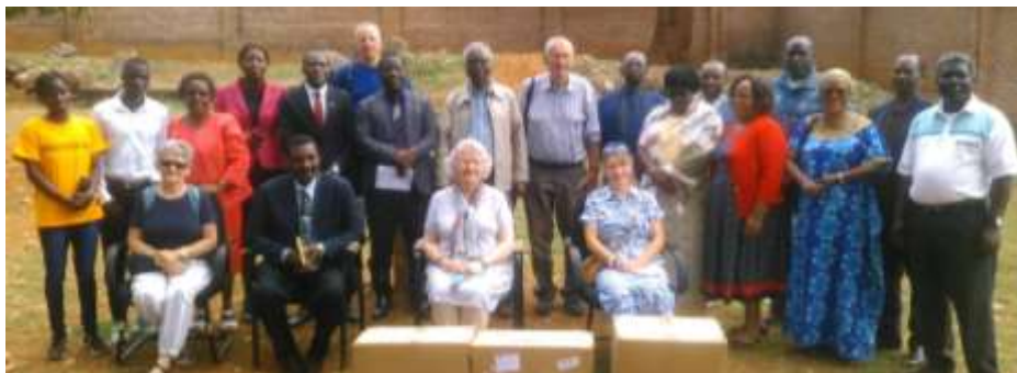
ZAP representatives from Causeway and Zomba together with Special Needs Education Co-ordinators Urban and Rural at the presentation of computers and other items from the recently arrived container.

The success of ZAP is dependent on the two halves of our charity, in Coleraine and Zomba, working together in honest endeavour to raise funds and to use that funding wisely. Our partnership with Emmanuel International in Zomba is also essential for the effective delivery of larger projects, such as Mbilima. Being supportive of each other's efforts is one of the foundations of ZAP's success.