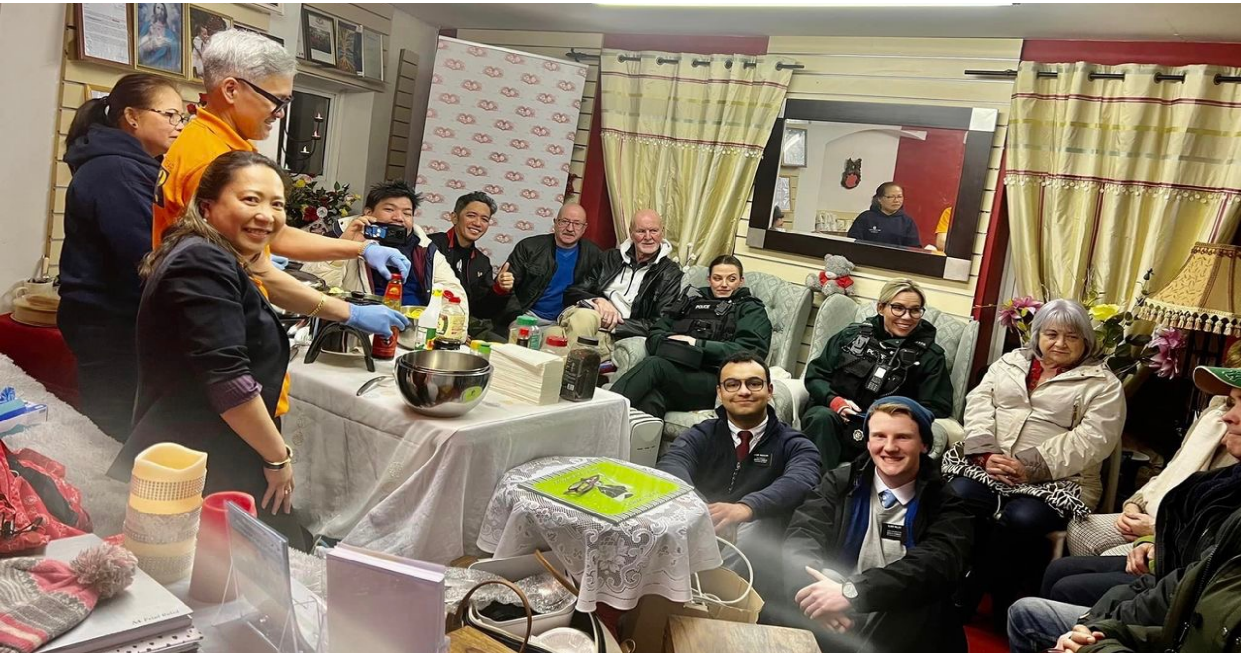
Celebrating the March, International Womens' Day with guests from PSNI Omagh