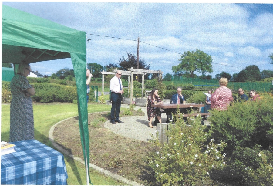
N.I.H.E. Chairperson visits Fox Park gardens