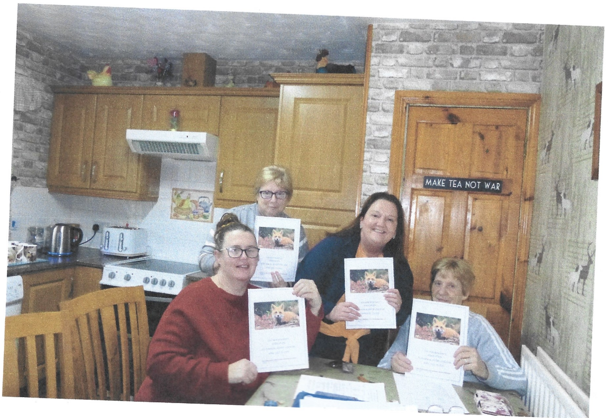
FOX PARK RESIDENTS ASSOCIATION NIC 102925