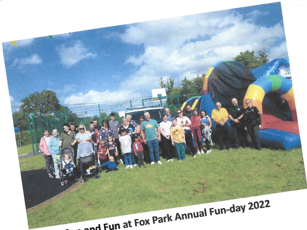
Sun and Fun at Fox Park Annual Fun-day 2022