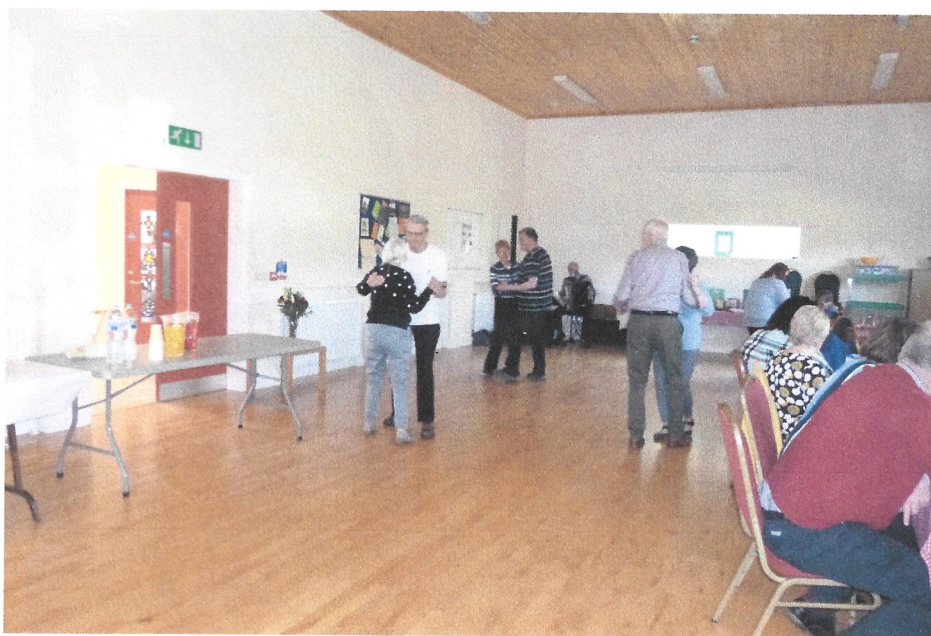
Team building and networking event with other Community Groups