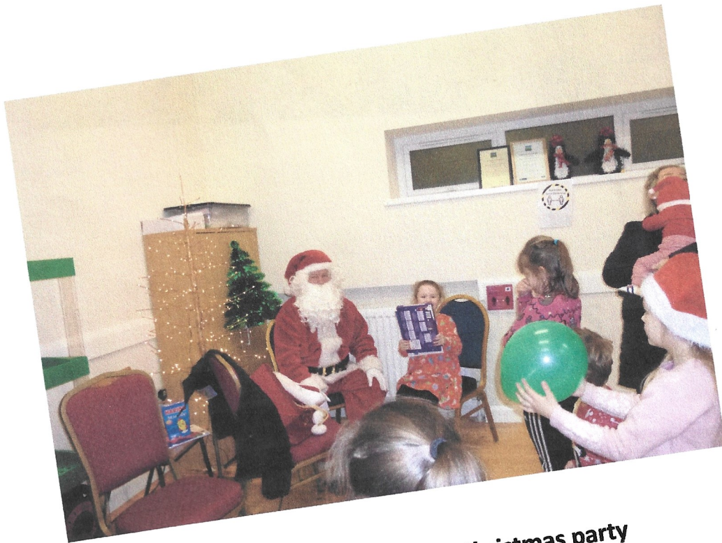
A visit from Santa at our Christmas party

FOX PARK RESIDENTS ASSOCIATION NIC 102925