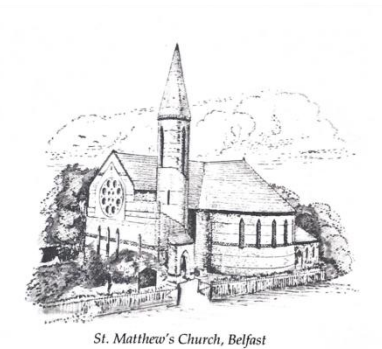
St. Matthew's Church, Belfast