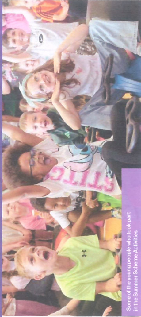
Some of the young people who took part in the Summer Scheme Activities