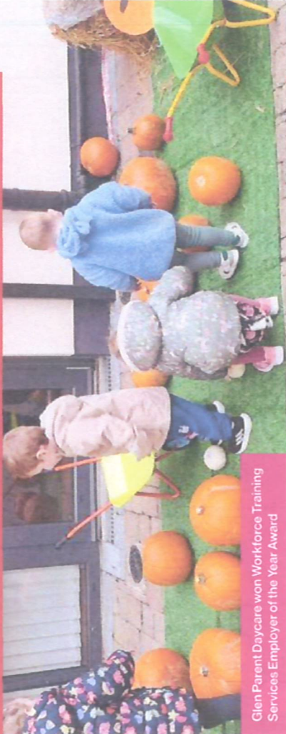
Glen Parent Daycare won Workforce Training Services Employer of the Year Award