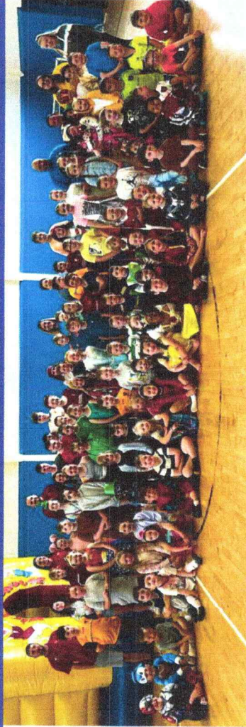
Some of the young people who took part in the Summer Scheme Activities