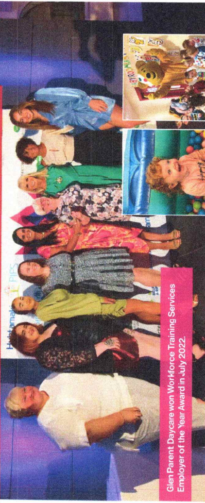
Glen Parent Daycare won Workforce Training Services Employer of the Year Award in July 2022.