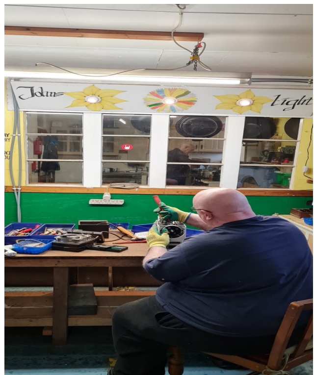
Mano Dismantling a sewing machine for spares