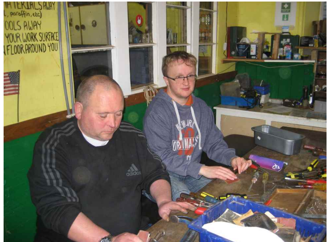
Some of our volunteers

TFS Downpatrick will have appropriate premises, personnel and funding to meet the agreed outputs and objectives of the organisation.