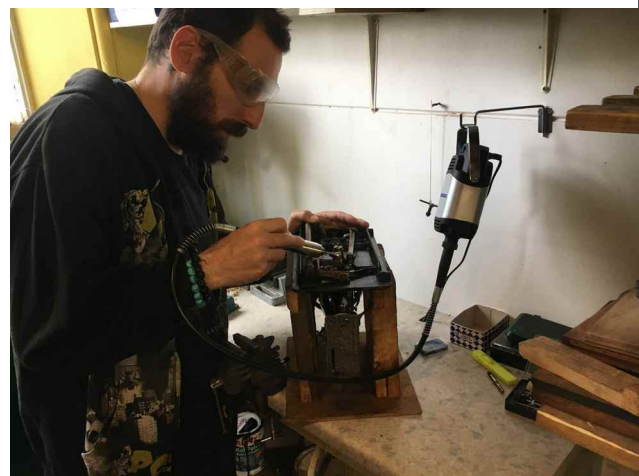
Work in progress