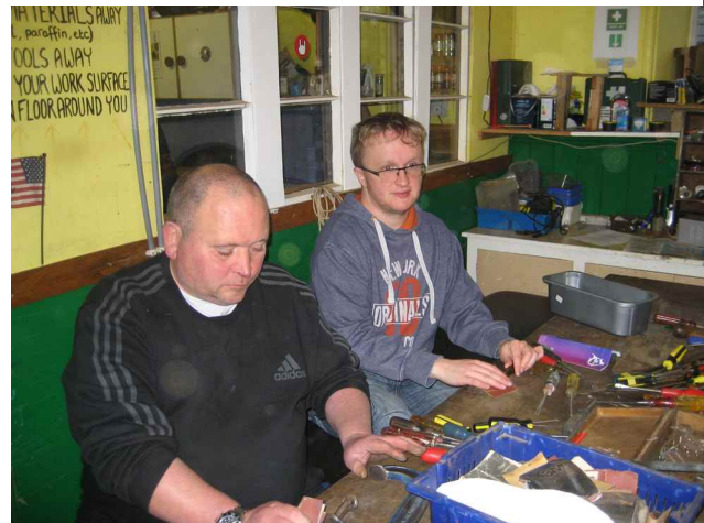
Some of our volunteers