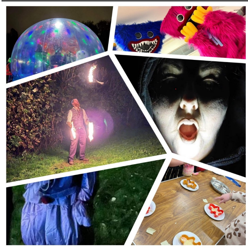
cold October weather to ensure the whole community go home with a fright.