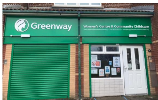
Greenway Women's Centre