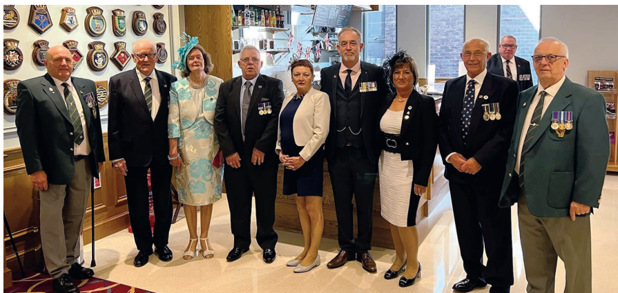
Summer RP in Buckingham Palace

Royal Garden Party 12th May: A small group of NI beneficiaries with two escorts, enjoyed a few days in London participating in the Not Forgotten Royal Garden Party where HRH The Princess Royal was in attendance. Thankfully a bright dry day and many celebrities for our veterans to meet.