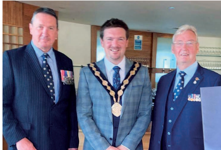
Armed Forces Day with the Mayor