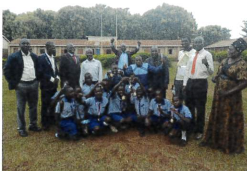
Debating team winners