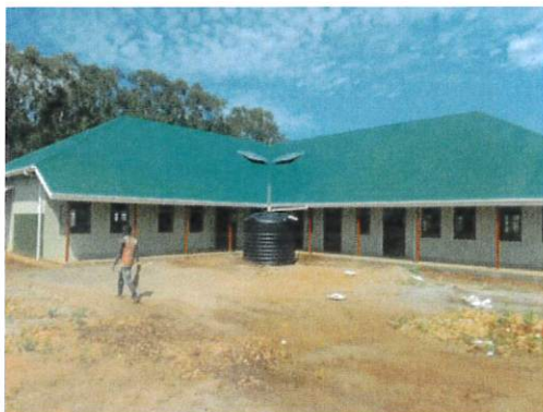
Boys Dormitory nearing completion

for the financial year ended 31 August 2025