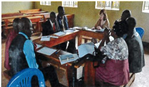
Primary Head Teacher training