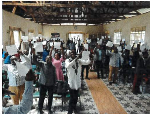
Church leaders with their attendance certificate