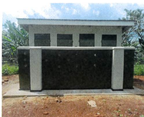
New Girls Latrines