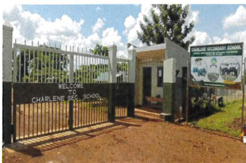
Entrance to Charlene Secondary School

Building work for the secondary school was always planned in two phases. The plan was that this would allow the school to begin to function with the second phase of building following soon after as numbers and classes in the school increased. This financial year substantial work was completed or started on Phase II including, staff and girls' latrines, solar power and equipment for the dormitories as well as fittings and beds for the dormitories for students to sleep in. Additionally, the fence surrounding the school was completed, and a second boys dormitory was started as well as the A Level and Administration Block. There are a few remaining buildings to be completed and then Charlene Secondary School will be fully functional and operational. This is extremely encouraging and transformational in this community as more children will have the opportunity to attend and complete secondary school as a result.