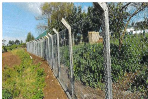
Fence around school compound