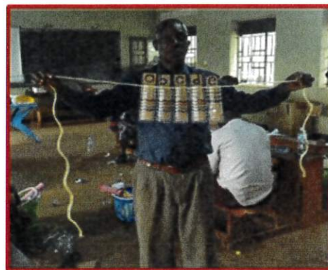
Teachers creating their own resources