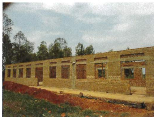
Work started on A Level Block

Connections between pupils in Uganda and pupils in Northern Ireland have continued to occur as well as training via zoom with teachers and pastors in Uganda and teachers/pastors here. This has been enabled due to good internet connections as well as laptops and technology at the school. This is a great tool to allow continuous learning and awareness of pupils here of the needs of those across the world.