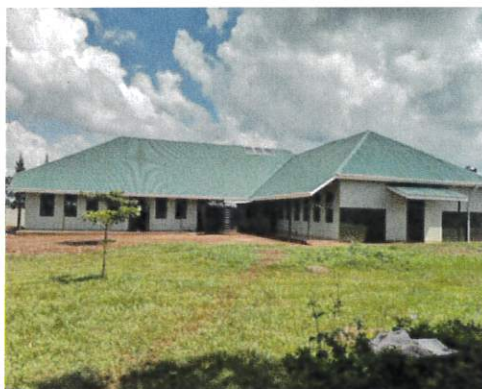
Completed Girls Dormitory