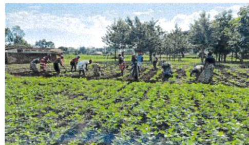
Parents in school garden