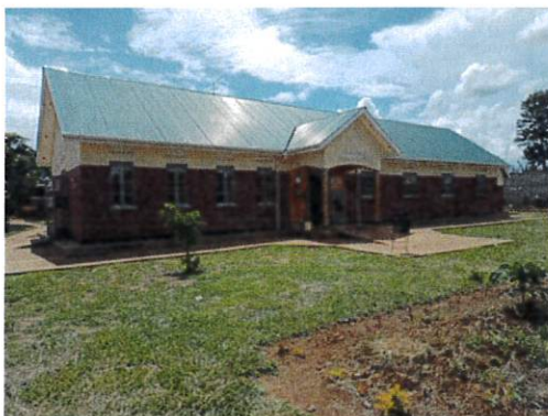
Diika Health Centre Maternity

We will continue to work closely with local government officials to see Diika upgraded to a Level 3 Health Centre so that it can receive more staffing, funding and resources to function at an ever greater capacity.