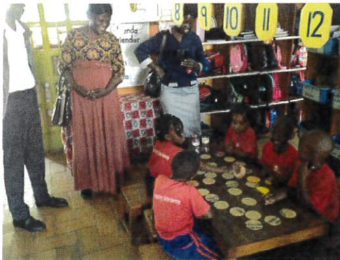
Low-cost resources being demonstrated

We continue to be committed to the 8 local primary schools around Charlene Secondary School that we affectionately call the Kiryandongo Cluster. There continues to be so many needs in each of these schools. Being a small organisation, we are unable to meet all of these needs; however, this past financial year we have been able to focus some finances, resources and time on teacher training in each of these primary schools to help support the teachers and management who are doing an amazing job in very difficult situations. This has involved visits from individuals in Northern Ireland in November and April to carry out management training with Headteachers and training with teachers. Additionally, we have started to partner with Red Earth, a Ugandan NGO, who are carrying out literacy training with teachers in each of the 8 primary schools to improve outcomes for students in early years to help improve outcomes in upper primary and secondary school, as well as retainment of students. Additionally, IT training was also provided for the Headteachers in the 8 cluster primary schools in the use of laptops to help improve collaboration between the primary schools and improve outcomes from the literacy training.