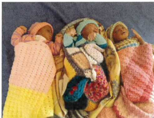
Babies born who have received knitted clothes