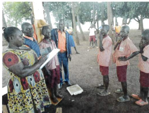
Height checking before football tournament