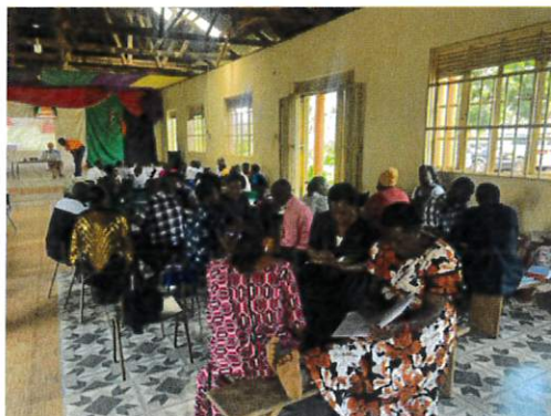
Delegates at Pastors Conference

for the financial year ended 31 August 2025