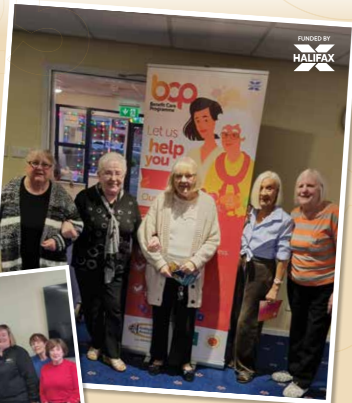
Ashton Older Peoples Group and the Residents of Holyrood House.

This programme had a remarkable impact, and we are actively seeking funding to secure a dedicated Advice Worker for older residents.: