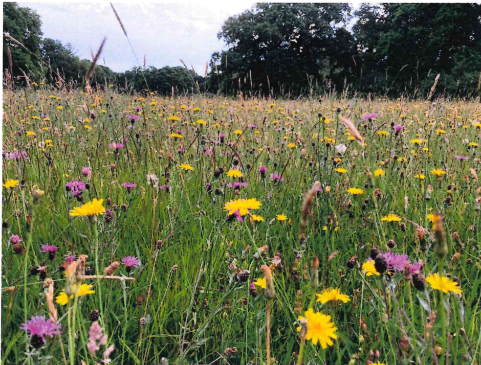
Cover photograph: Meadows at Brackett's Coppice