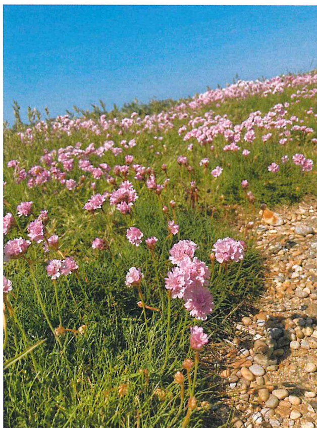
Thrift on Chesil Beach

Registered in England as Dorset Environmental Records Centre Trust Company Limited Reg. Office: DERC, Dorset History Centre, Bridport Road, Dorchester, Dorset DT1 1RP Registered Charity No. 900287 Registered Company No. 2447393 VAT Registration No. 834 5747 06