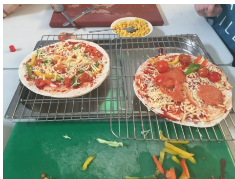
ASD Youth Group