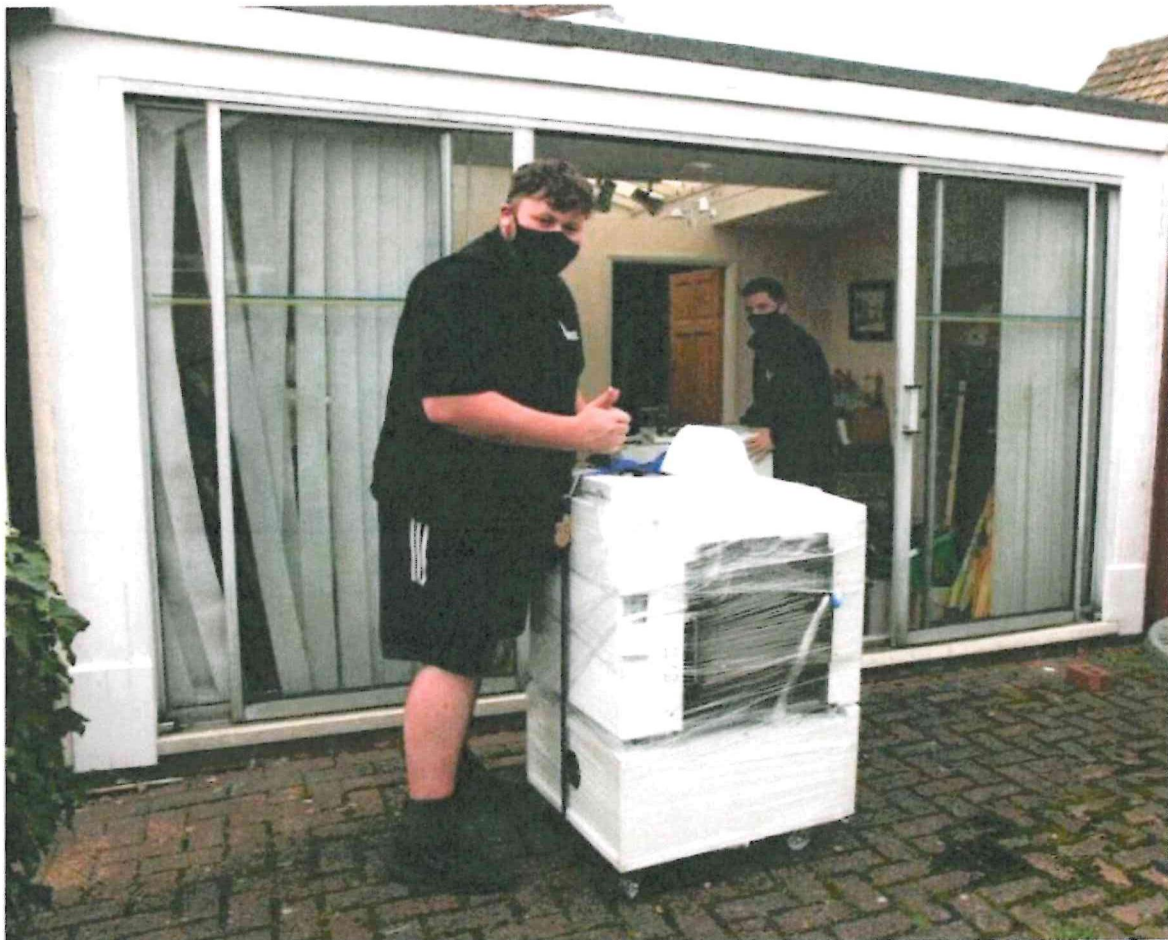
Taking delivery of the new copier at Great Bently Parish News