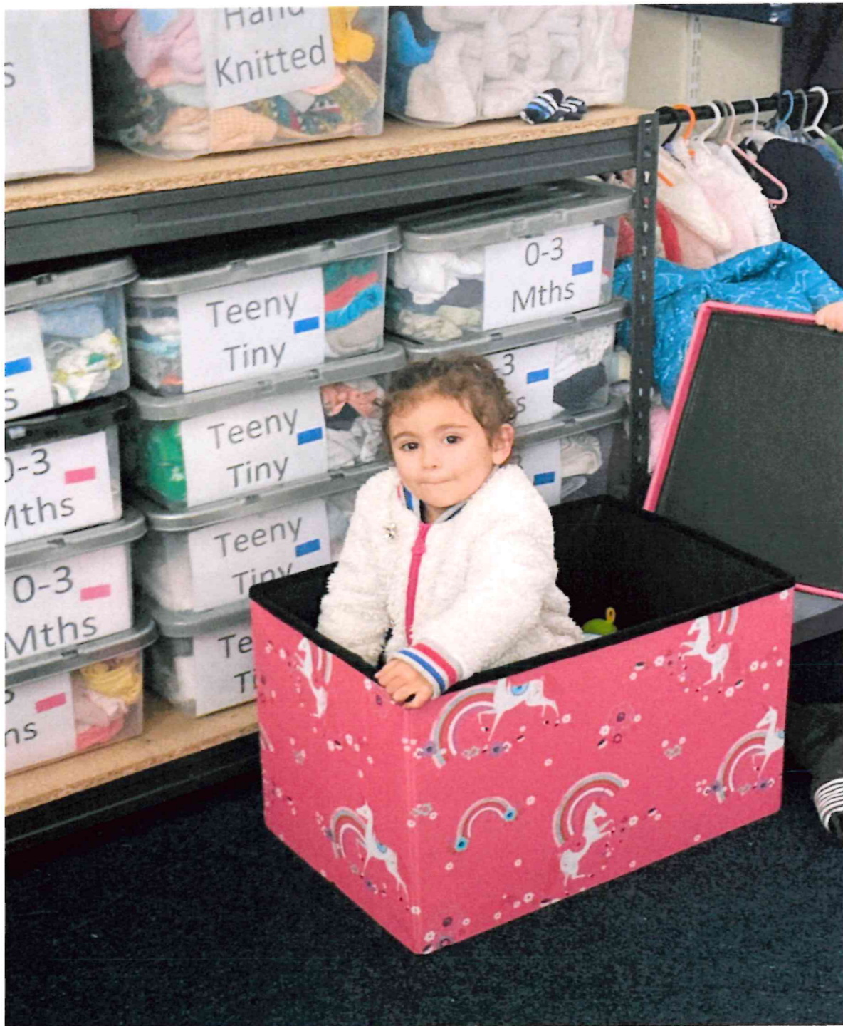
In amongst new shelving provided to Harwich Hive Baby Bank.