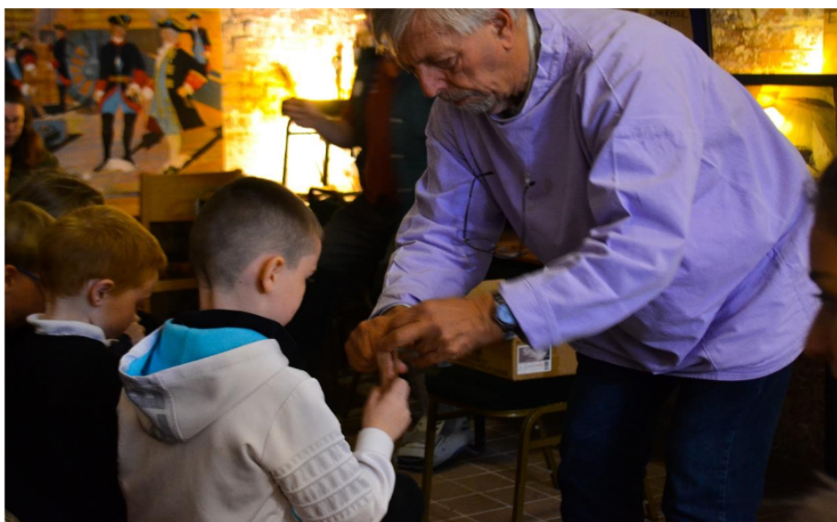
Everyone gets busy at the Harwich International Shanty Festival