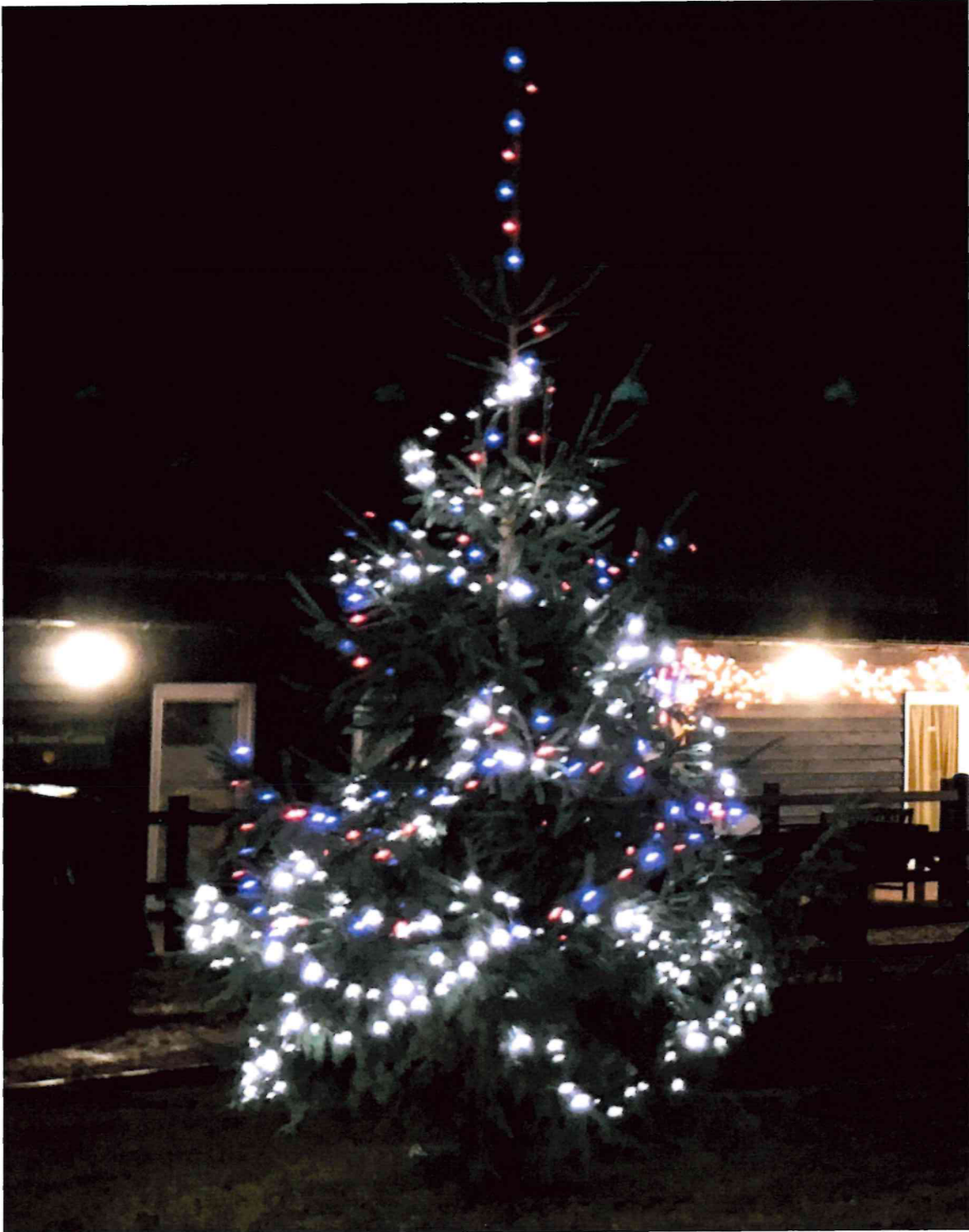
Bringing Christmas cheer for the residents and visitors at Acorn Village, Mistley.