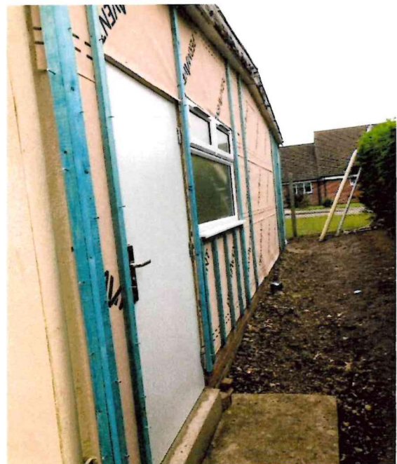
Volunteers get busy at the Tendring Brass Band clubhouse with a major refurbishment project