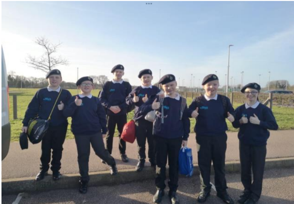
Walton Junior Sea Cadets wearing new sweatshirts courtesy of Grassroots