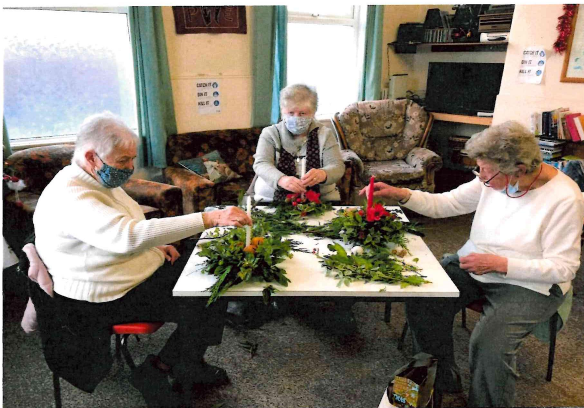
Creative Expression Community Group