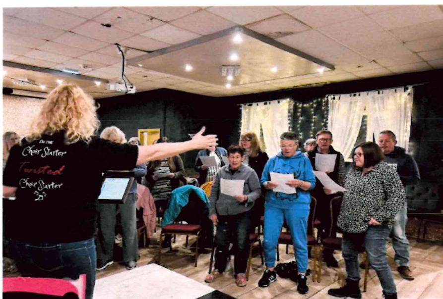
Clacton Mental Wellbeing Choir