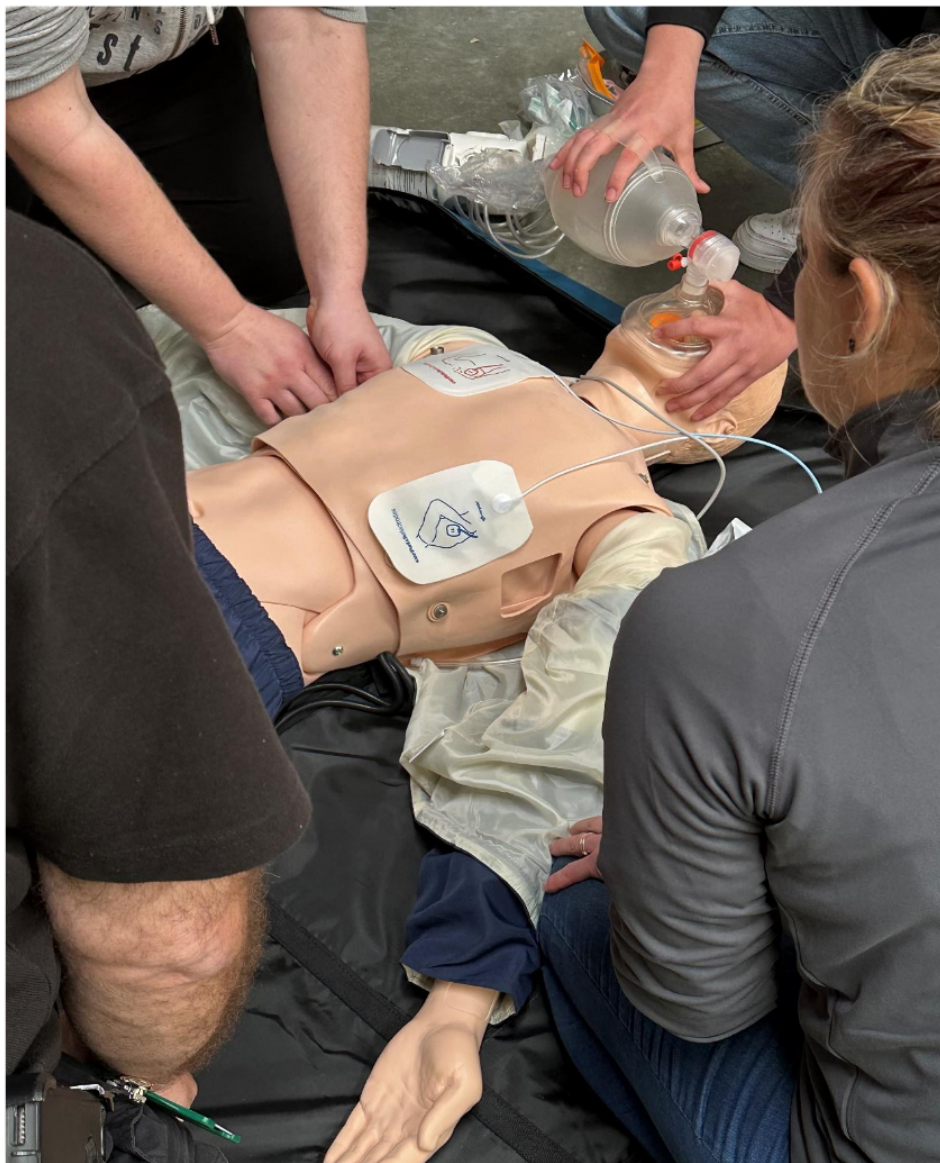
Volunteer medic practice life-saving skills for road-side critical care in Essex