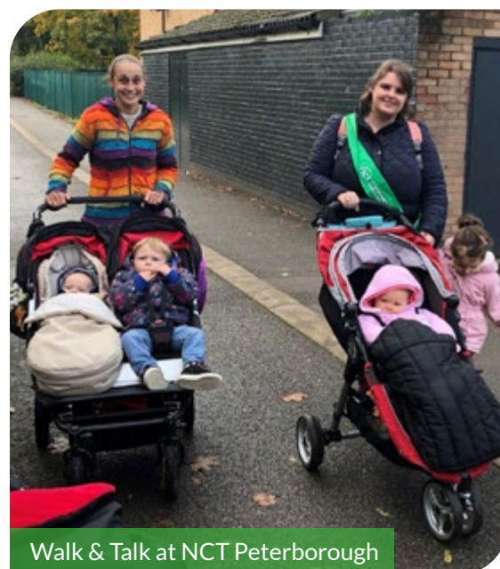
Walk & Talk at NCT Peterborough

By the end of March 2021, over 70,000 parents had accessed online courses and workshops, over 27,000 parents had attended volunteer-led Walk and Talks, over 18,000 parents had been supported with feeding their babies and we had seen over 5 million visits to our online information centre.