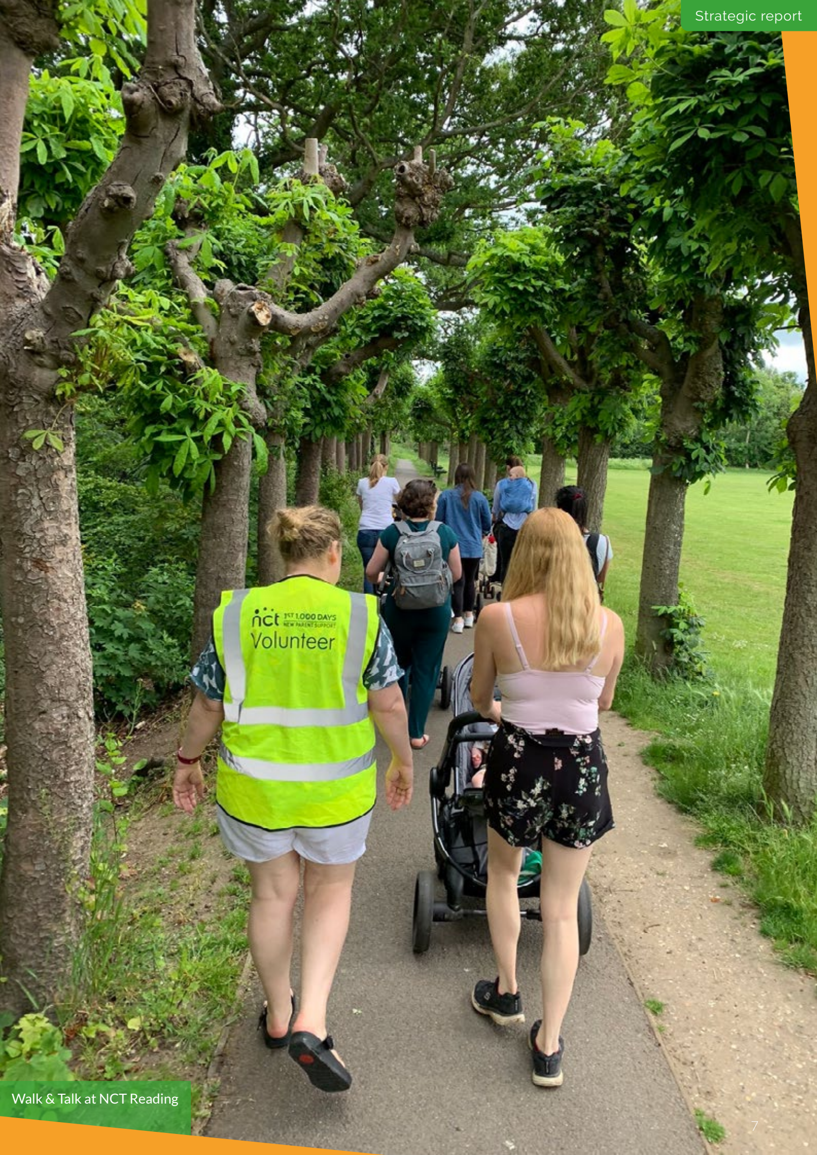
Walk & Talk at NCT Reading