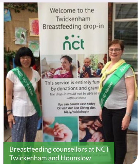
Breastfeeding counsellors at NCT Twickenham and Hounslow

Clinical Service Manager – Hounslow Health Visiting Team.