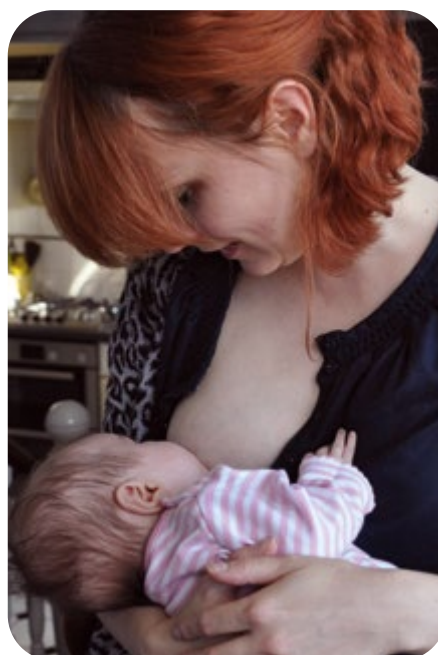
Parents supported on the NCT Infant Feeding Line.

“It is so reassuring to know that we can call so late at night as things get stressful at that time.”