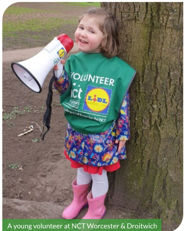
A young volunteer at NCT Worcester & Droitwich

The fast paced and high-quality work of the Action Team involved speaking to people from across our community, including parents, volunteers, staff, trustees and practitioners.