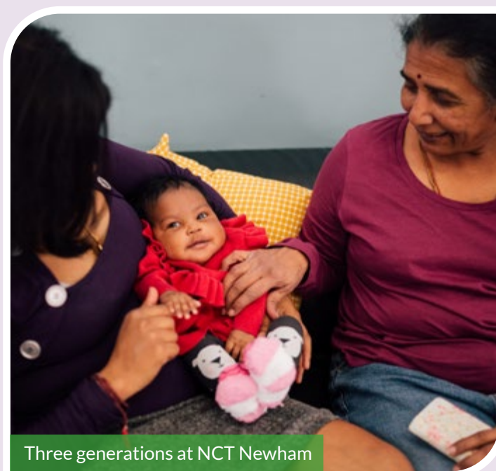
Three generations at NCT Newham

The programme has a strong focus on co-production, accessibility and inclusion to ensure a meaningful response to the specific barriers and challenges that marginalised women experience in gaining support and engaging with perinatal services. The programme includes access to psychological support, recognising that many of the women have complex needs and have experienced trauma, including those who are survivors of trafficking, domestic violence, seeking asylum or experiencing homelessness.