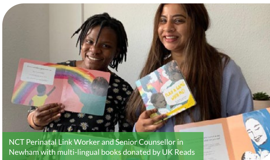
NCT Perinatal Link Worker and Senior Counsellor in Newham with multi-lingual books donated by UK Reads

We have also committed to undertake the charity's first comprehensive all-community Diversity Audit to provide strong baseline data from which to further develop our equity, diversity and inclusion priorities over the next 3-5 years.