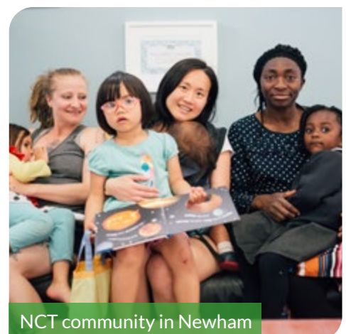
NCT community in Newham

This includes antenatal and postnatal courses delivered by our skilled practitioners, a range of free community-based activities and events led by our fantastic volunteers, and highly valued breastfeeding and infant feeding support provided by specialist NCT breastfeeding counsellors. In addition, a range of trained peer support programmes support women and families facing specific challenges, such as social isolation, feeding difficulties or poor mental health.