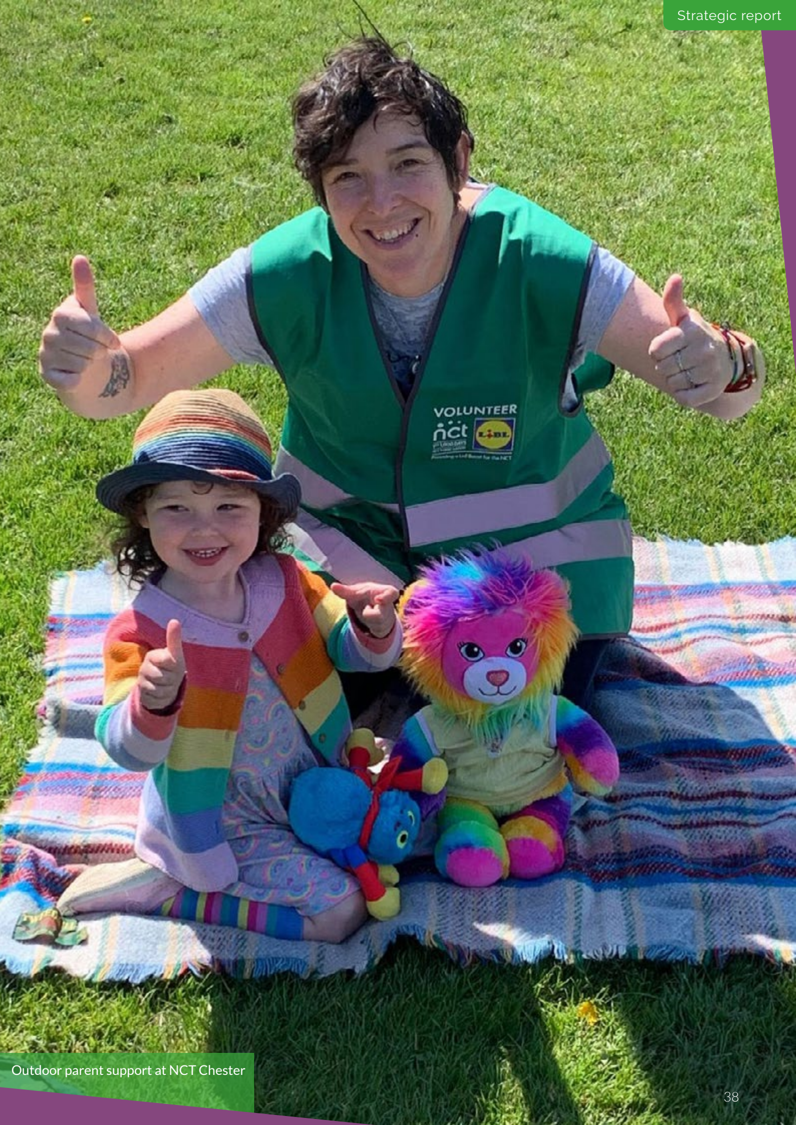
Outdoor parent support at NCT Chester