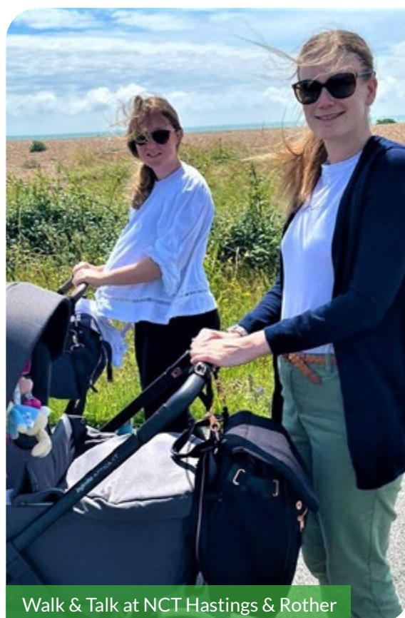
Walk & Talk at NCT Hastings & Rother

Overnight we developed a new volunteer pathway which made it possible to recruit volunteers in areas where we did not have an existing local team. These volunteers were supported by our central staff team to implement Covid-specific safe operating procedures to mitigate risks and keep everyone safe. Walks were able to continue throughout Winter 2020 and the challenging early months of 2021, under specific guidance or exemptions for parent support in England and Scotland. Over 27,000 people attended walks from the launch in September 2020 to March 2021.