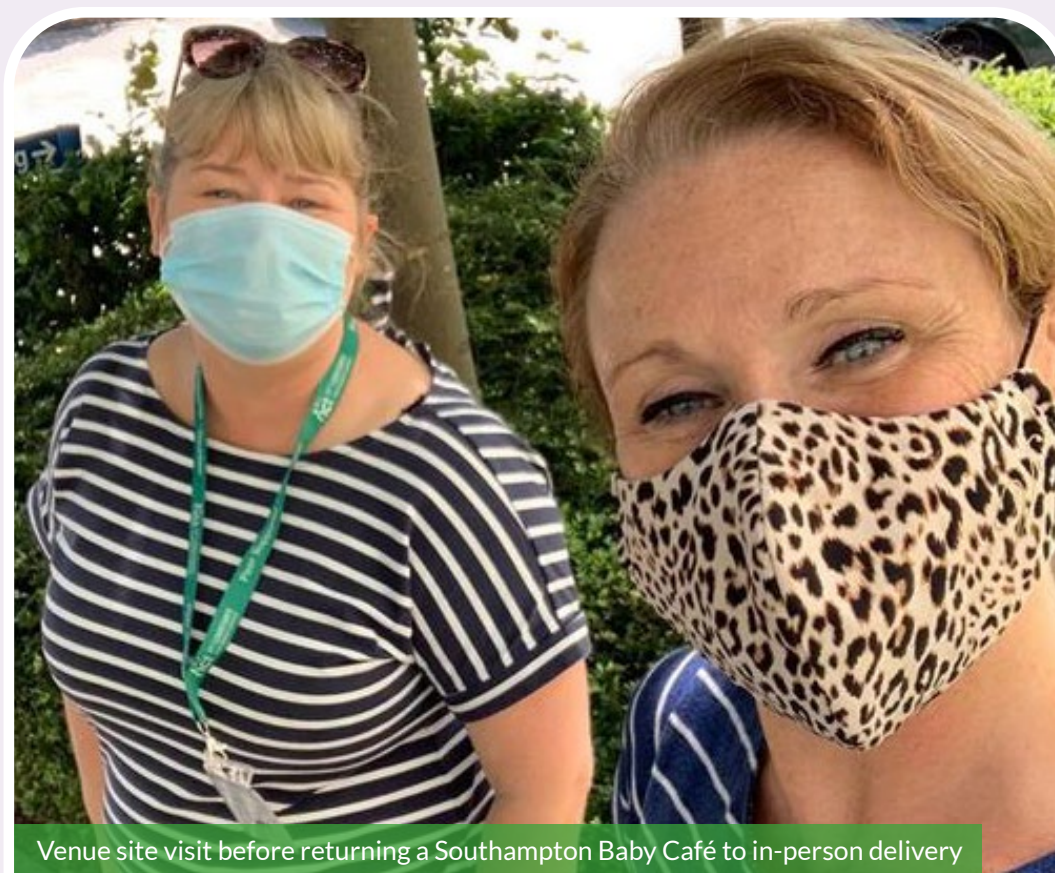
Venue site visit before returning a Southampton Baby Café to in-person delivery

During the early stages of the pandemic, NCT Baby Cafés and breastfeeding drop-ins delivered breastfeeding support remotely. Recognising the need for in-person support alongside the digital offering, we prioritised these services in our phased programme of unlock, developing safe operating procedures to re-open community support from November 2020 and supporting breastfeeding counsellors to restart at a time that felt comfortable for them and their local community.