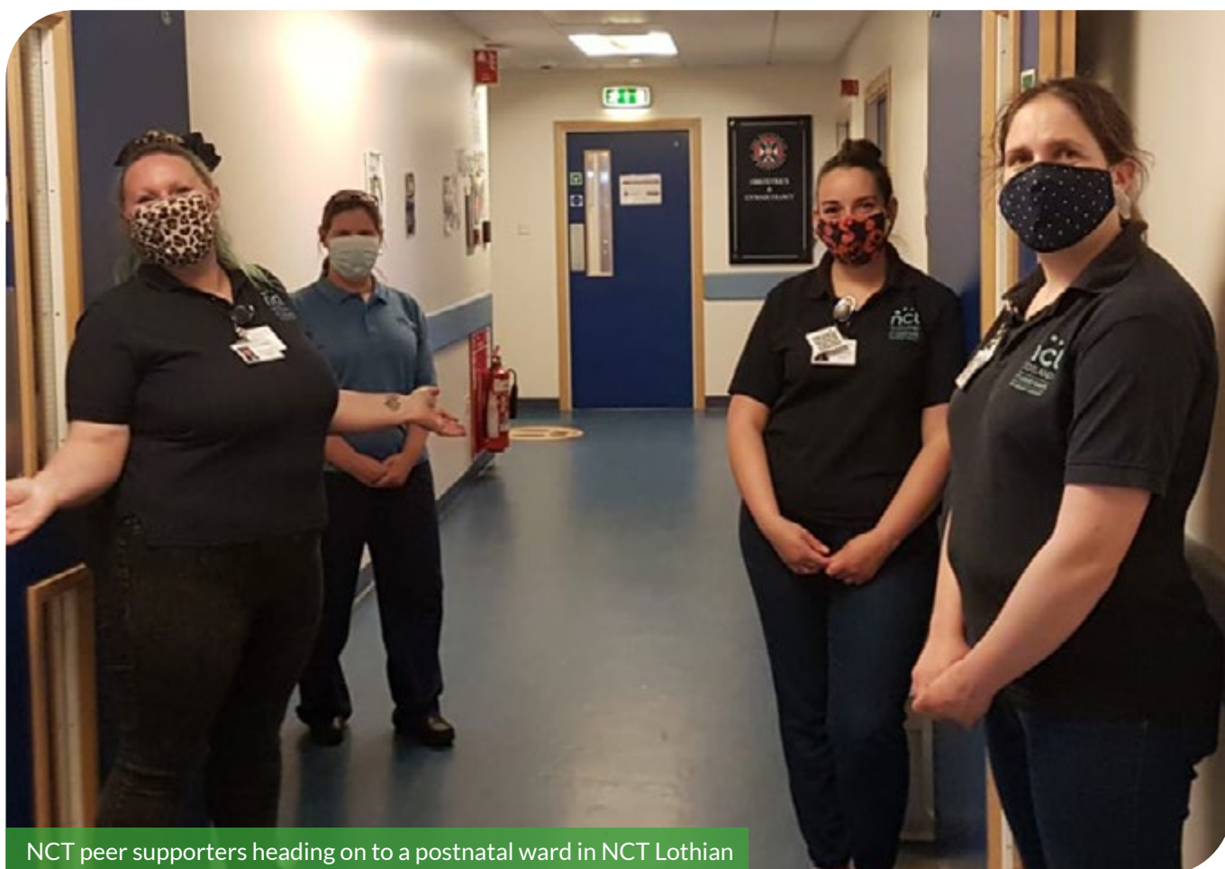
NCT peer supporters heading on to a postnatal ward in NCT Lothian

Though the requirement for social distancing and mask wearing meant that support couldn't be provided with usual ease, women attending really appreciated the opportunity for in-person support and breastfeeding counsellors and peer supporters reported a strengthening of services by being able to provide a blend of in-person and online support.