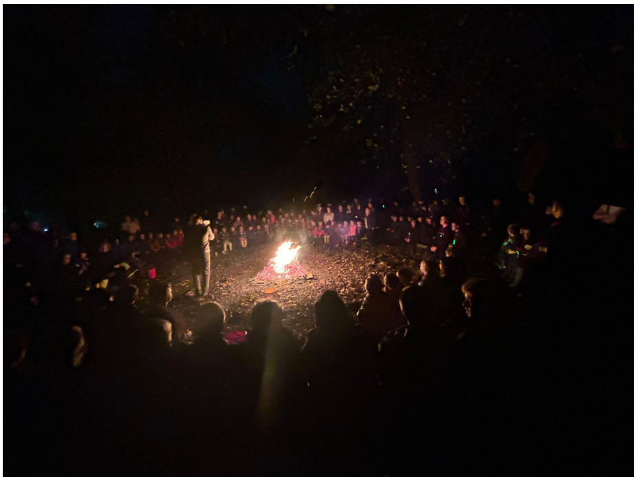
District Bonfire Night – Fylde Activity Centre