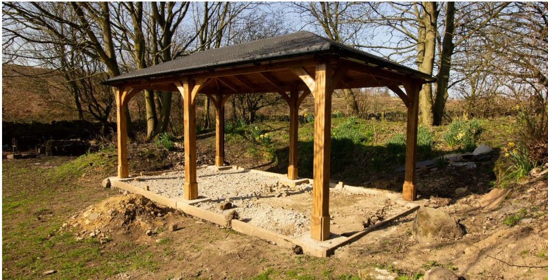
Mary Bushell shelter and base