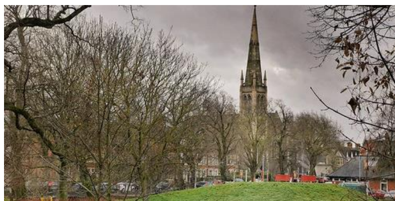
St Michael's, Roath