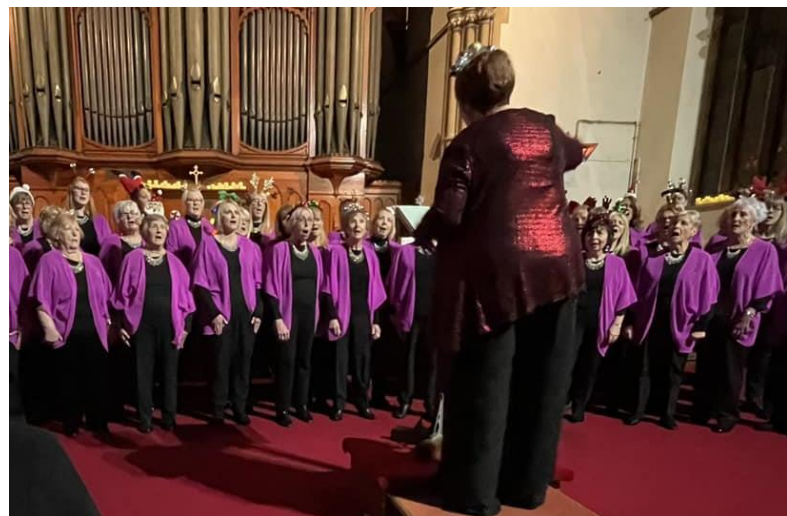
Dare To Sing Ladies Choir

CMVC were assured and confident, though it was cold in certain areas of the church despite the best efforts of church wardens. Shrugging this off, the Choir entertained with a wide selection of popular numbers from their repertoire, as well as performing their debut of 'Let the River Run' to great praise.