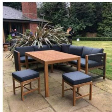
CONSERVATORY & GARDEN