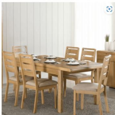
KITCHEN & DINING ROOM