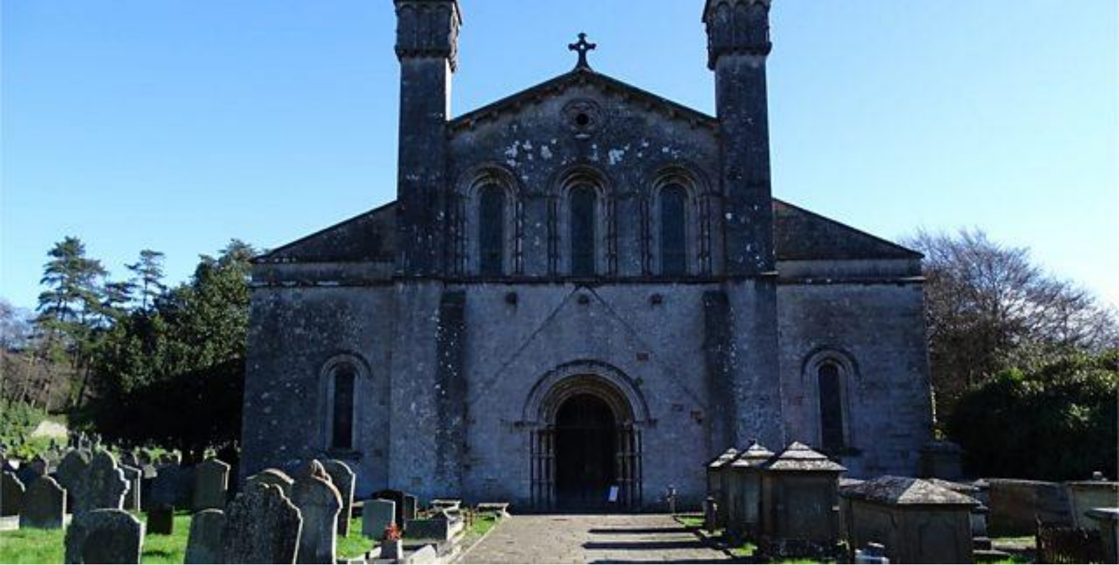
Again, raising money for Royal Welsh Agricultural Society charities, this time In the fabulous surroundings of Margam Abbey.