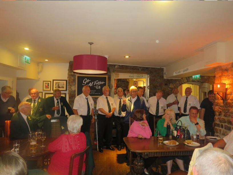
Annual Concert Memories