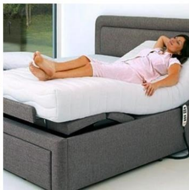
BEDS & BEDROOM