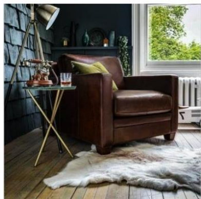
SOFAS & CHAIRS