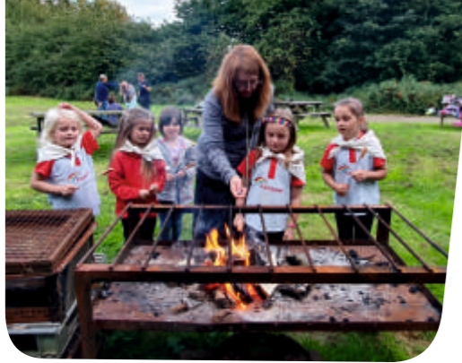
A summary of the number of girls in each Section in West Yorkshire South