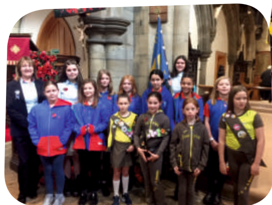
A summary of the number of volunteers in West Yorkshire South