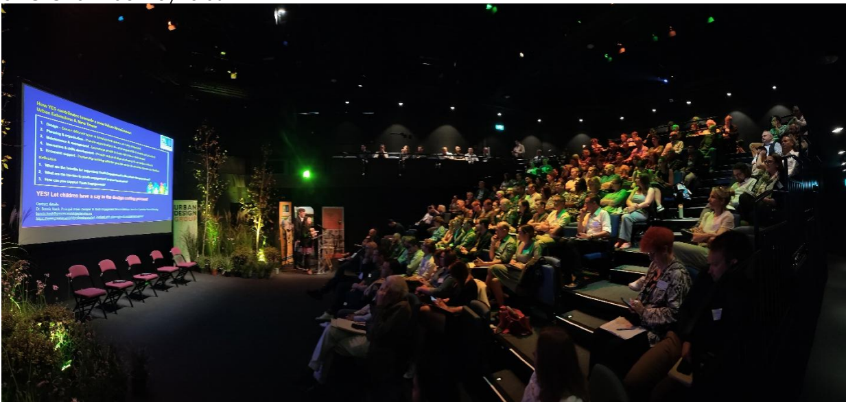
The conference stage of the Theatre Royal, Plymouth.