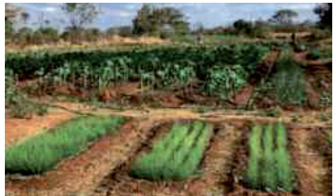
The school farm at Inyathi High School.

For the full report, see: http://www.radisol-client.co.uk/education-charity-zimbabwe/downloads/annual-report-min.pdf