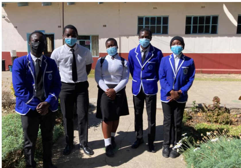
Upper Six Students at St Paul's Musami 2022

Some recent photographs from two of our northern schools, taken in Summer 2022