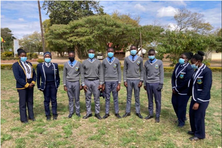
Our amazing students at Waddilove High School