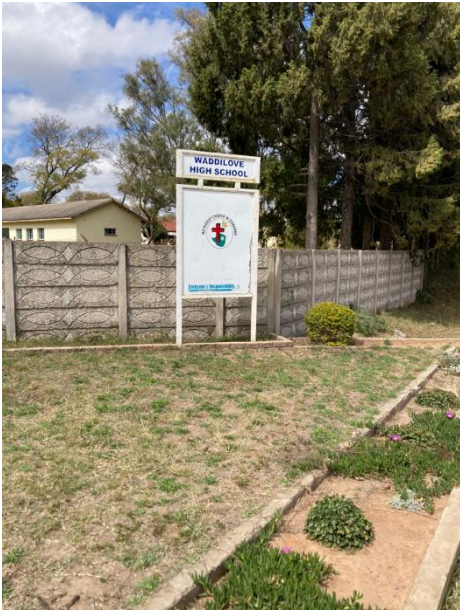
Waddilove School is a high-performing Methodist School in Zimbabwe