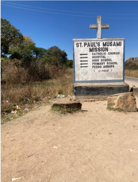
St Paul's Musami, one of our partner schools in Zimbabwe