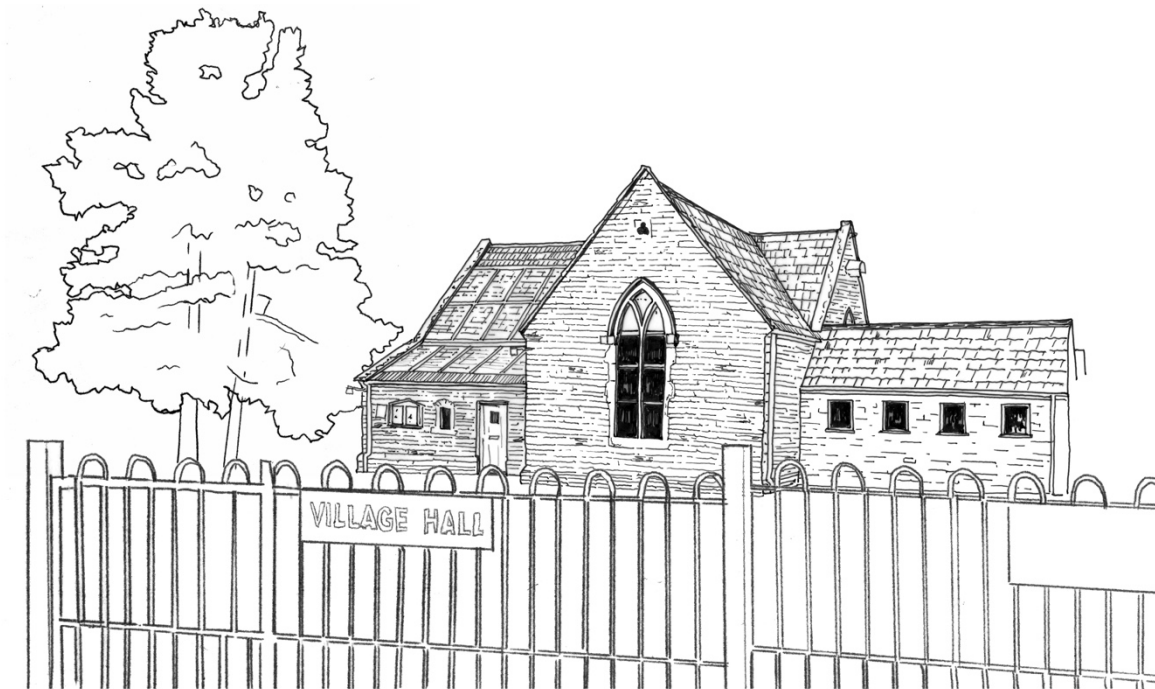
The Village Hall, Barton St David