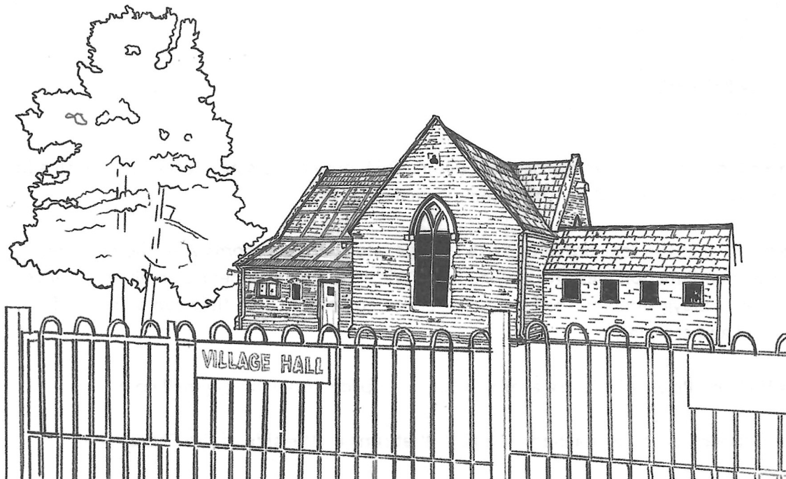
The Village Hall, Barton St David